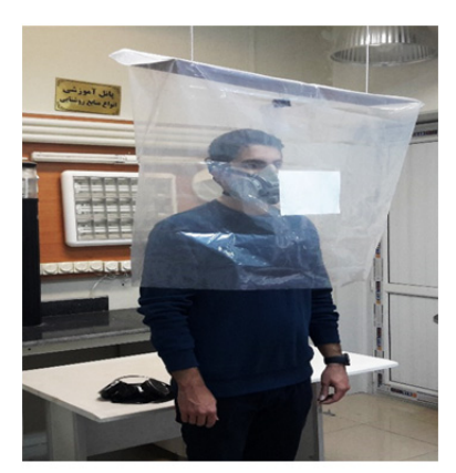
Fig. 1. The participant was inside the test hood during the IAA fit testing procedure.