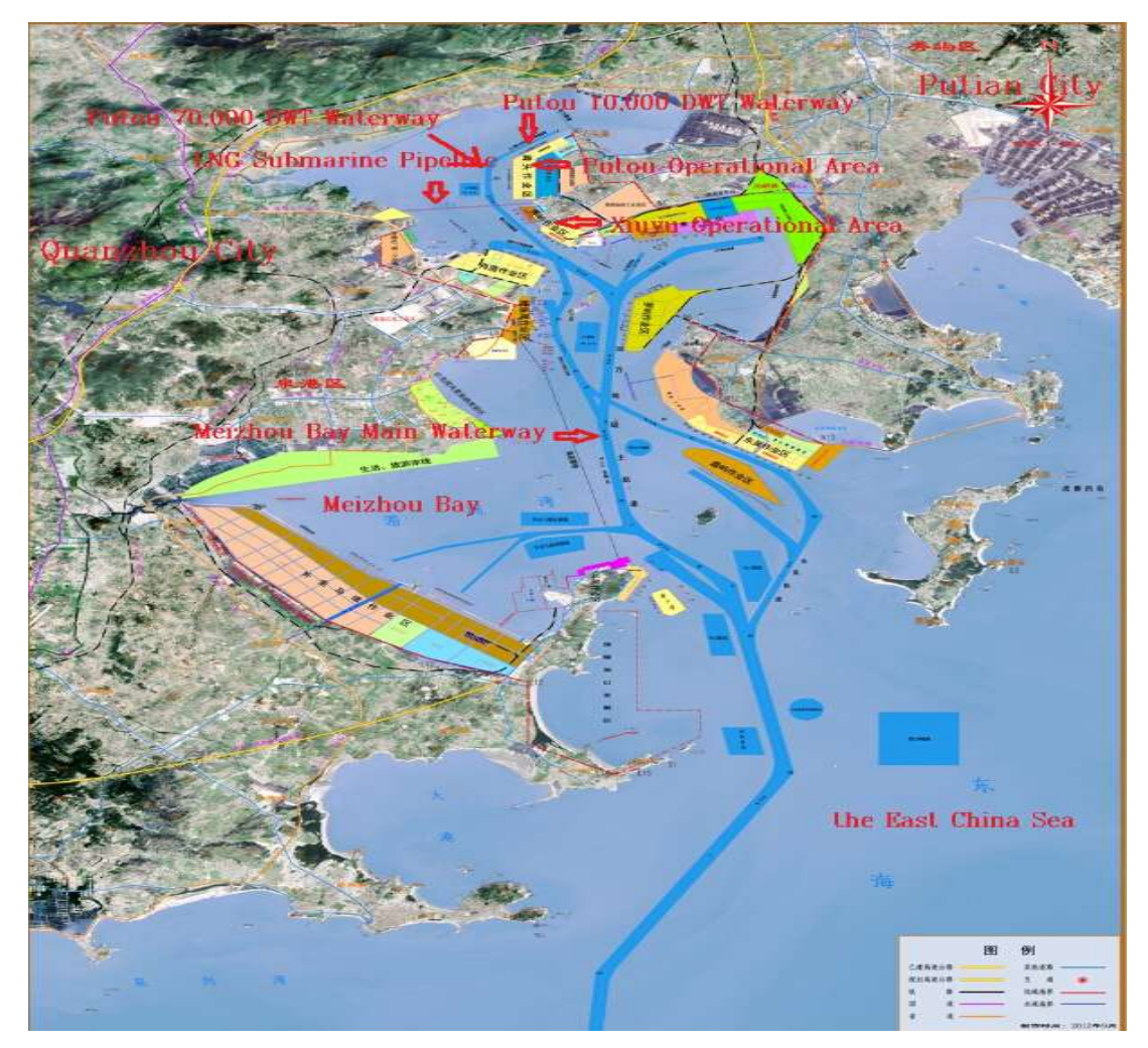
Figure.1- The general planning maps of ports and waterways in Meizhou Bay

handling capacity of 8000,000 Tons; supporting port for the refining engineering of Sinochem Group; the first "enclave Port" engineering cooperated between Jiangxi Province and Fujian Province, the import-export base for the liquid chemicals; the 300,000 DWT navigation waterway with the largest investments and highest level ever since in Fujian Province (Port Authority of Meizhou Bay, 2015).