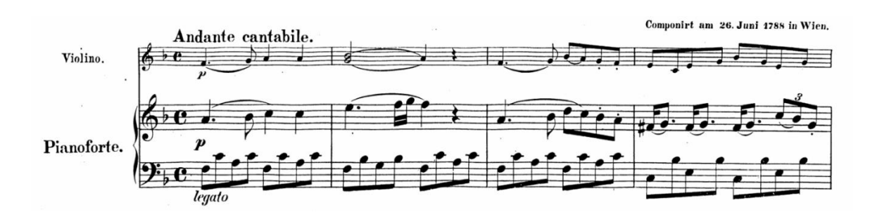
Example 9: Mozart Sonata for Piano and Violin, No. 43 in F major, K. 547 - Exposition<sup>22</sup>

With this information in mind, why could it not have been the violin sonatas of Mozart or Haydn that had the greatest impacts on him? After all, Mozart's K. 547 sonata (1788) somewhat exhibits equal melodic distribution, and even bears the title of Sonata for Piano and Violin, indicating an equal importance between violinist and pianist. Moskovitz and Todd even note the beginnings of a true dialogue between violin and piano in Mozart's earlier sonatas for piano and violin. The same holds true of his later sonatas for piano and violin, as is evidenced by Examples 9 and 10. In these examples, the violin and piano parts are very similar at the beginning, with the violin only slightly deviating from the piano's melody. Later, in the recapitulation, the violin assumes the role of accompaniment to the piano. This shows that Mozart uses the violin in a variety of roles just as Beethoven would later do with the cello.