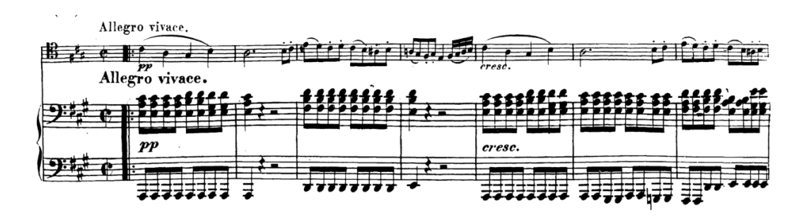
Example 19: Beethoven Sonata for Piano and Cello No. 3 in A-major, Op. 69 – Fourth Movement<sup>48</sup>

descending sequence of quarter notes played by the cello that do follow the same melodic shape. This can be seen at the outset of Example 20 in the cello line.