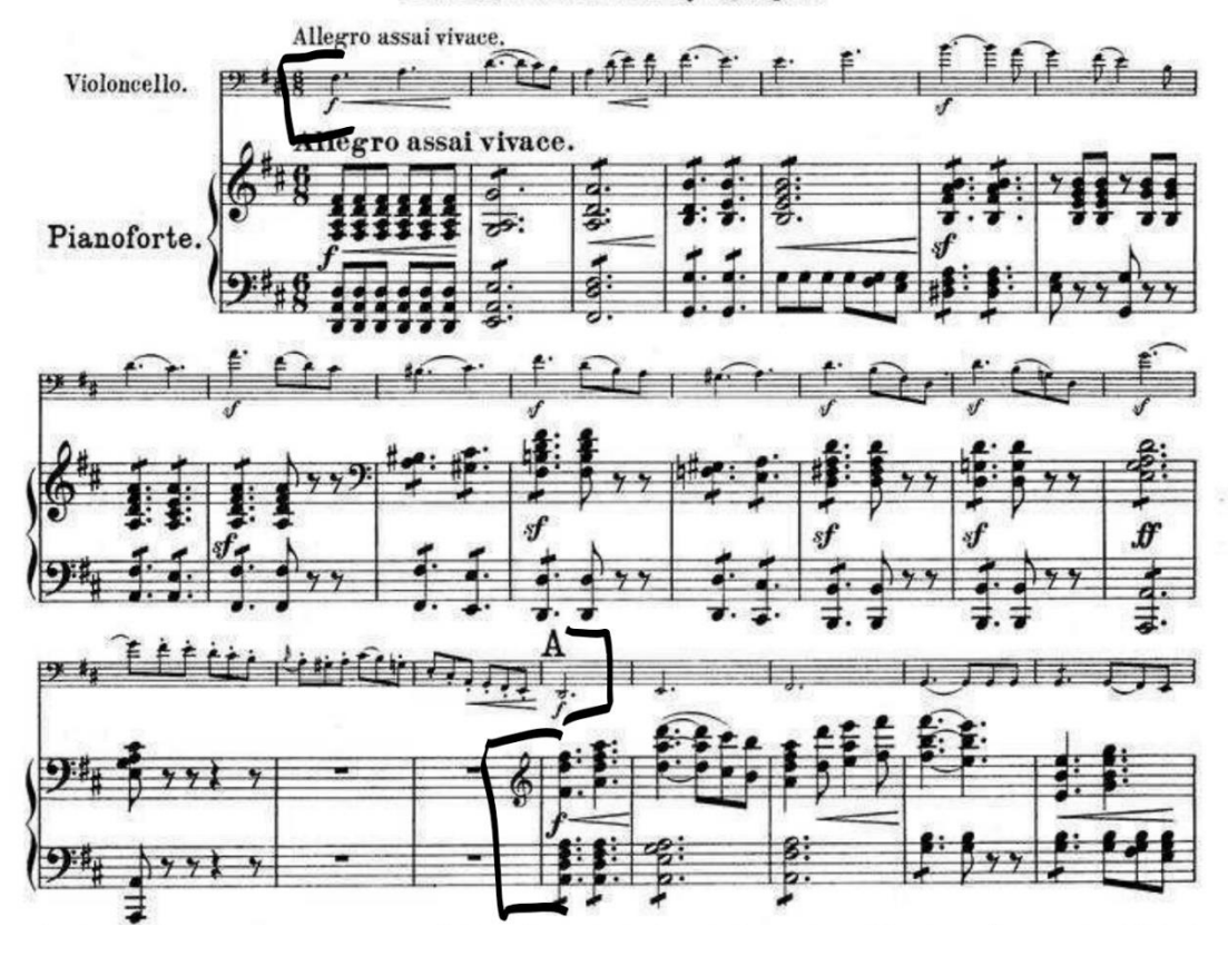
Example 12: Mendelssohn Sonata for Piano and Cello No. 2 in D-Major, Op. 58 – First Movement<sup>38</sup>