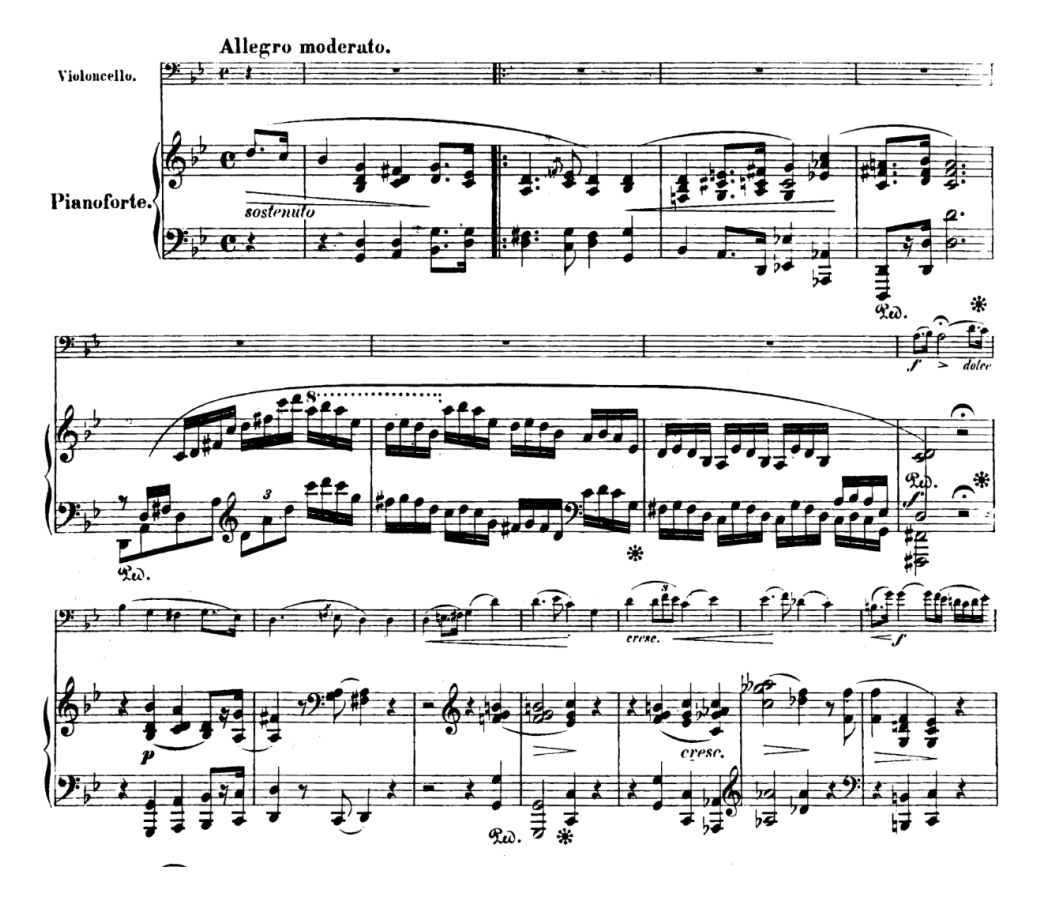
Example 33: Chopin Cello Sonata in G-minor, Op. 65 (mm. 1-15)81

Example 30 showed that Beethoven also cut his initial theme short without allowing it to fully develop, albeit not by way of a virtuosic piano cadenza in the way we see above. The similarities continue with the cello's bold entrance and subsequent meandering. The cello's line follows the same melodic shape for its first four measures that the piano had played previously, but it goes on to give us another phrase at m. 12. This new phrase quickly devolves into more adventurous writing in the form of virtuosic 16<sup>th</sup>-note runs for the cello. Following that, we are introduced to yet another four-bar phrase, this time lyrically sweet and completely unheard until this point. Incredibly, at the end of this phrase, we are introduced to yet another completely new theme upon returning