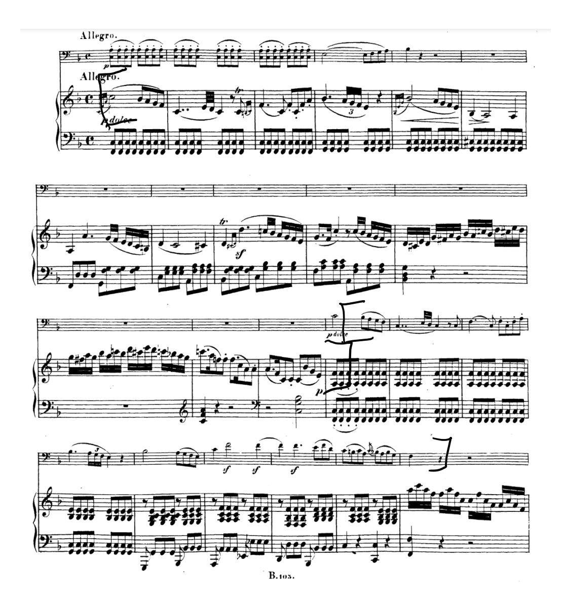
Example 5: Beethoven Sonata for Pianoforte or Harpsichord and Violoncello No.1, Op. 5<sup>10</sup>