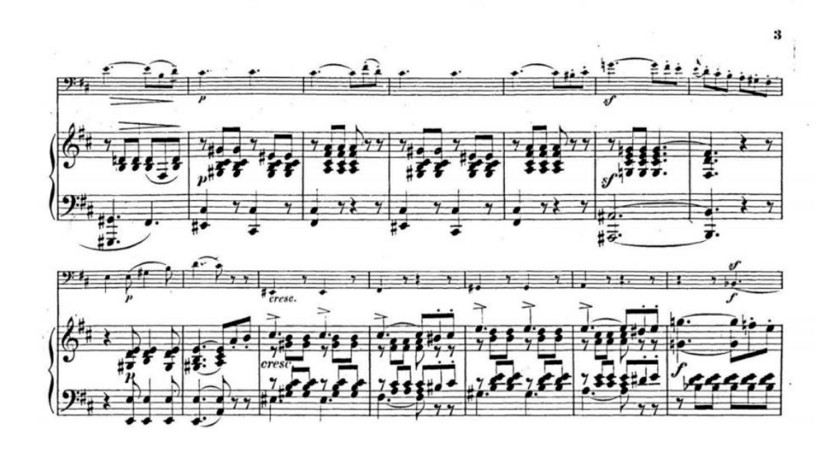
Example 13: Mendelssohn Sonata for Piano and Cello No. 2 in D-Major, Op. 58 – First Movement, Secondary Theme<sup>39</sup>