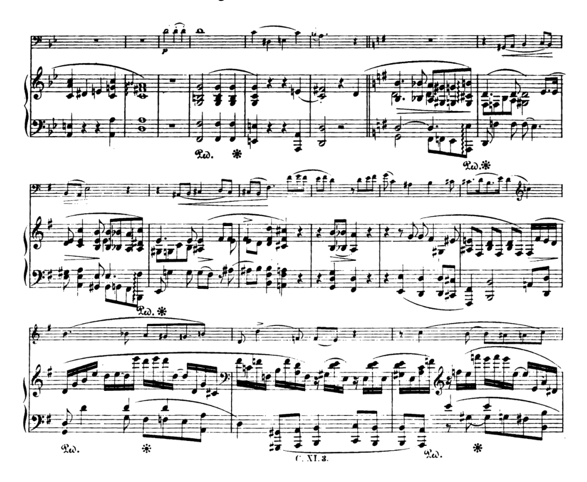
Example 43: Chopin Cello Sonata in G-minor, Op. 65 – 1st Movement<sup>95</sup>

this passage. What this shows is that Chopin's writing, while very similar to Beethoven's in how they both rapidly exchange ideas, has its own personal branding, and it is not as if Chopin reverts to an older model of composition without altering the approach; there is some musical evolution occurring.