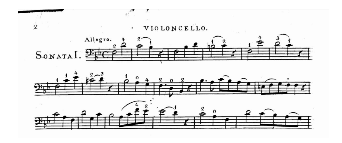
Example 3: Romberg Cello Sonata No. 1 in B-Flat Major, Op. 43 (Cello 1)8

manuscript underfoot.<sup>6</sup> In fairness to Romberg, he was a supporter and friend of Beethoven, but this particular instance serves to illustrate how Beethoven pushed boundaries in ways that were not always received well by his contemporaries. Romberg's reaction is understandable and predictable. He, like Boccherini, was first and foremost a cellist, and writing music specifically tailored to the instrument was perhaps his highest priority.<sup>7</sup> This is apparent in his Cello Sonata No. 1 in B-Flat Major, Op. 43 (pub. 1821).