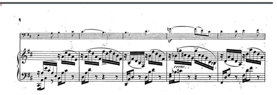
Example 14: Mendelssohn Sonata for Piano and Cello No. 2 in D-Major, Op. 58 – First Movement, Secondary Theme cont.40

Tomasz Rzeczycki notes that there are some striking similarities between this opening theme and that of Beethoven's A-major sonata (compare Examples 15 and 16).<sup>41</sup> Their initial statements are similar in contour, but they have some noticeable differences. Beethoven outlines a tonic triad in the first two measures by leaping from low A (A2) up a fifth to an E (E3). He then ascends to the upper neighbor of F-sharp (F-sharp 3) for three beats before descending back down to a C-sharp (C-sharp 3), which is the third of