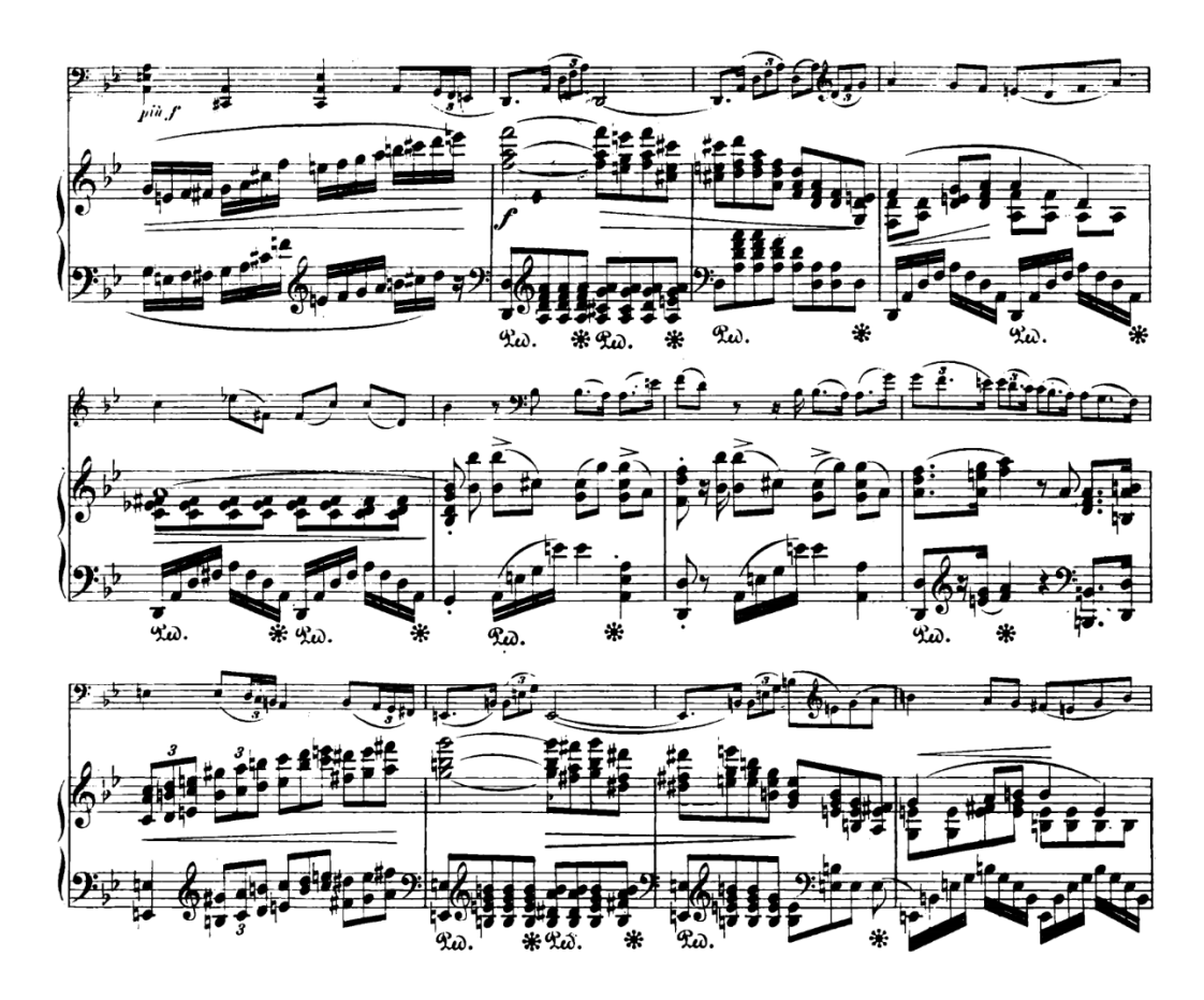
Example 35: Chopin Cello Sonata in G-minor, Op. 65 - Development<sup>83</sup>