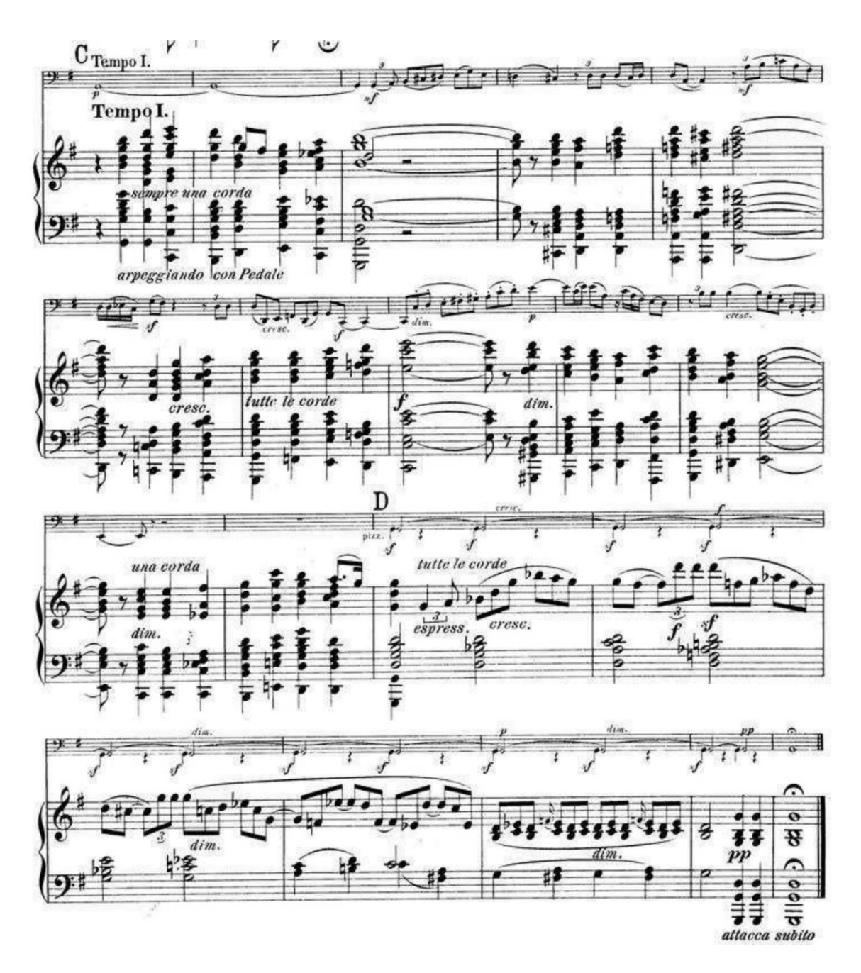
Example 27: Mendelssohn Sonata for Piano and Cello, No. 2 in D-Major, Op. 58 – Third Movement<sup>62</sup>

This movement is not simply Mendelssohn's attempt to pay homage to Bach and build upon Beethoven's idea of equal melodic distribution, and it is certainly not without its own Romantic elements and his own personal branding. Mendelssohn juxtaposes the