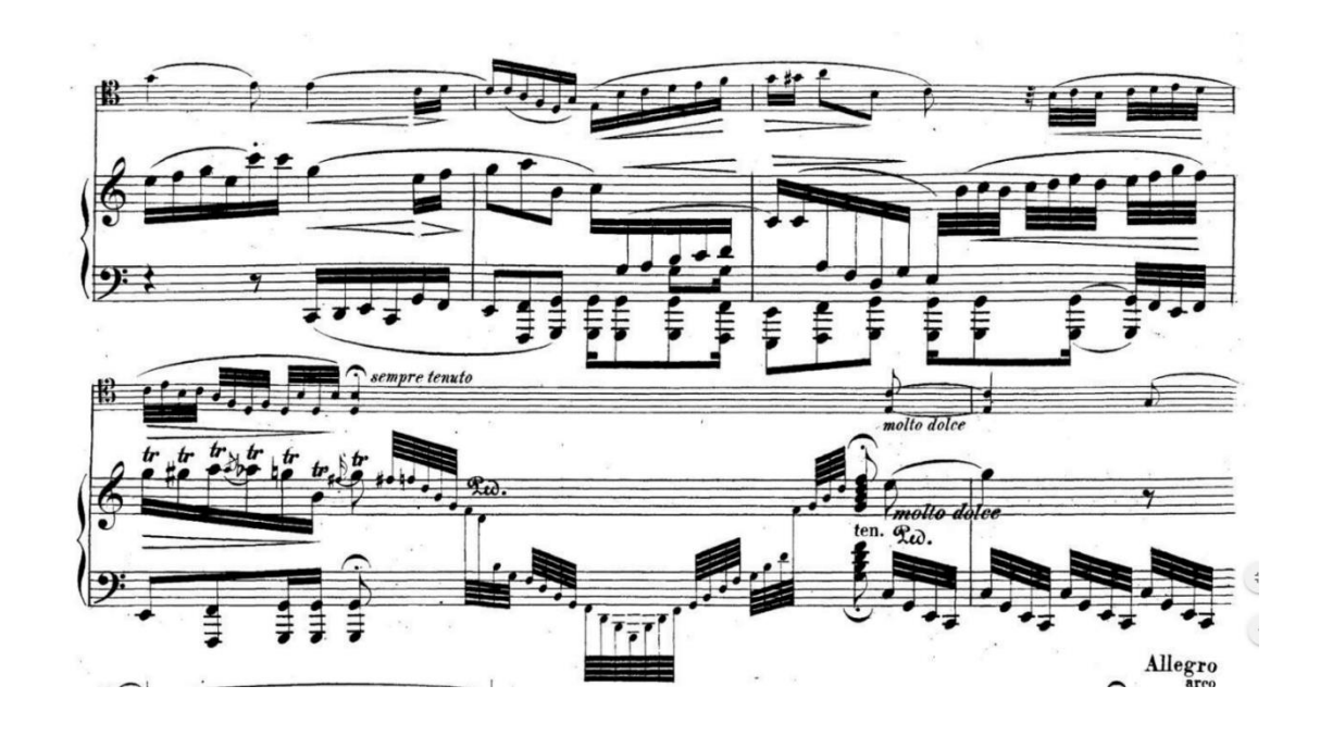
Example 32: Beethoven Sonata for Piano and Cello, Op 102 No. 1 - First Movement (mm. 21 - 25)<sup>75</sup>

these features which led Beethoven to initially subtitle the work as Freie Sonate , "Free Sonata."<sup>74</sup>