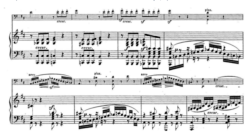
Example 18: Mendelssohn Sonata for Piano and Cello No. 2 in D-Major, Op. 58 – Fourth Movement<sup>47</sup>

The second similarity concerns the cello's four quarter notes in the first measure of Beethoven's fourth movement (Example 19). Without quoting Beethoven directly, Mendelssohn also incorporates a four-note motive later in his own finale. While it does not follow the same melodic contour initially, he reiterates it until it gives way to a