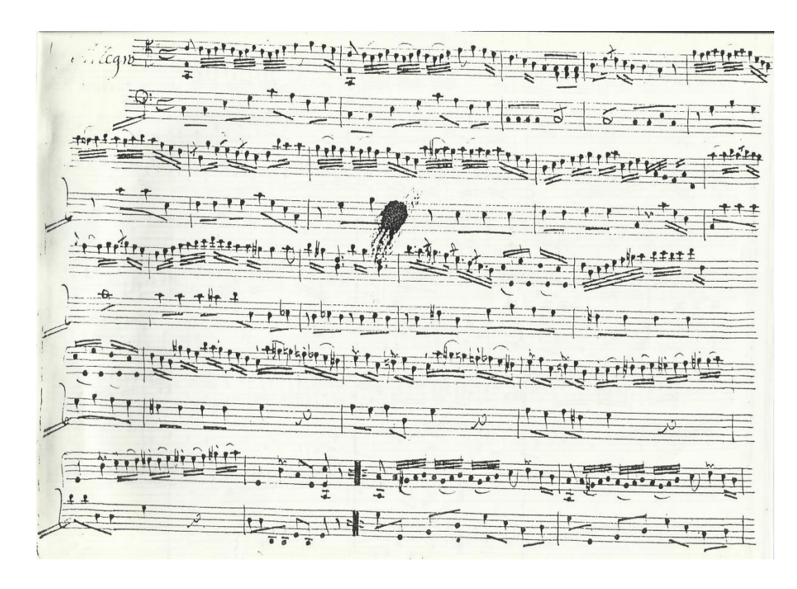
Example 2: Boccherini Cello Sonata No. 3 in C-major, G. 64

Bernhard Romberg, a cello virtuoso and acquaintance of Beethoven, takes a similar approach to writing his own cello sonatas (Examples 3 and 4).<sup>5</sup> Romberg delegates all melodic workload to cello 1, while cello 2 accompanies. As an acquaintance of Beethoven and one of the last composers to write for cello in this style, his opinion of Beethoven's music helps to underscore just how revolutionary the latter's music really was for its time. Upon reading through the cello part for Beethoven's first Razumovsky quartet, Romberg allegedly remarked that the music was "unplayable" and trampled the