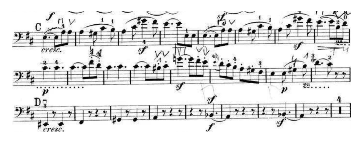
Example 24: Mendelssohn Sonata for Piano and Cello No. 2 in D-Major, Op. 58 - First Movement<sup>56</sup>

By contrast, Mendelssohn takes a much bolder approach in what he asks of the performers, particularly the cellist. Gone are the fluid, scalar melodies of the older generation, having been replaced by more aggressive and angular melodic gestures (Example 24). The heroic undertones become more overt in the daring leaps and dramatic position shifts that the part demands of its cellist. Mendelssohn and Beethoven both share the same idea of virtuosity that challenges a performer to simultaneously focus on phrasing and accuracy. The difference between the two is that Beethoven's sonata should sound and feel effortless, while Mendelssohn's is overtly athletic and is intended to sound that way. If the virtuosity of the A-major sonata is a tightrope walk, Mendelssohn's D-major sonata is a flying trapeze act, complete with sweeping melodies and daring leaps of fate. In this case, he is focused on showmanship.