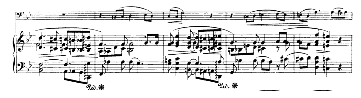
Example 37: Chopin Cello Sonata in G-minor, Op. 65 – Mvt. 1 (Secondary Theme)85

repeated later in the recapitulation. This is also an interesting point of discussion in that Chopin chooses to forego repeating the first half of the two-part exposition before the medial caesura . This prevents the improvisatory opening from having any lasting impact in the listener's mind as the first movement comes to a close. In fact, the only recurring thematic or motivic material that repeats from the outset of the exposition is the piano cadenza followed by the ominous dotted-eighth/sixteenth in the cello, which acts as a sort of harbinger of each major section within the movement (i.e. exposition, development, recapitulation). The takeaway from this is that, while the two composers seem to have a different approach in terms of form, the ultimate effect of incorporating an improvisatory overture in the beginning of their respective sonatas is the same.