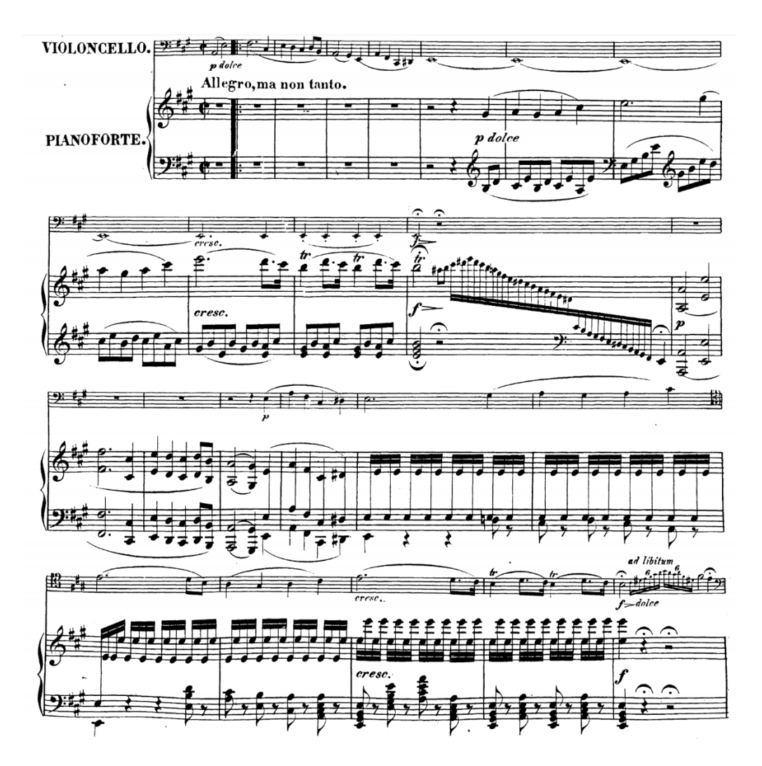
Example 7: Beethoven Sonata for Piano and Violoncello in A-major, Op. 69<sup>16</sup>

The beginning of this sonata highlights Beethoven's melodic and harmonic approach in the first movement. In the first four melodic statements, he repeatedly denies the listener harmonic closure at the end of each phrase but maintains continuity by allowing the piano to begin afresh with a new phrase after the end of its first cadenza. This sets up the next melodic exchange for the middle of the next phrase. This continuous act of melodic counterbalance gives the impression of a relay race, whereby the baton is the melody and the finish line is harmonic closure.