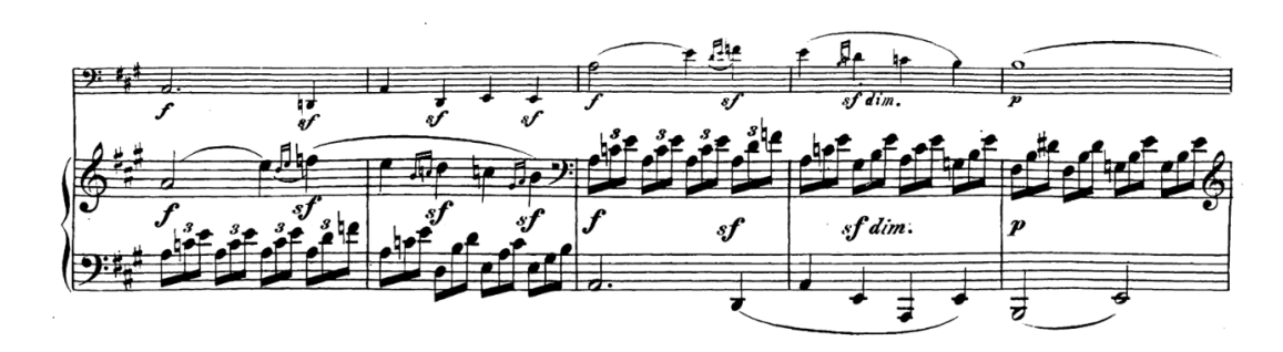
Example 21: Beethoven Sonata for Piano and Cello No. 3 in A-major, Op. 69 – First Movement<sup>51</sup>