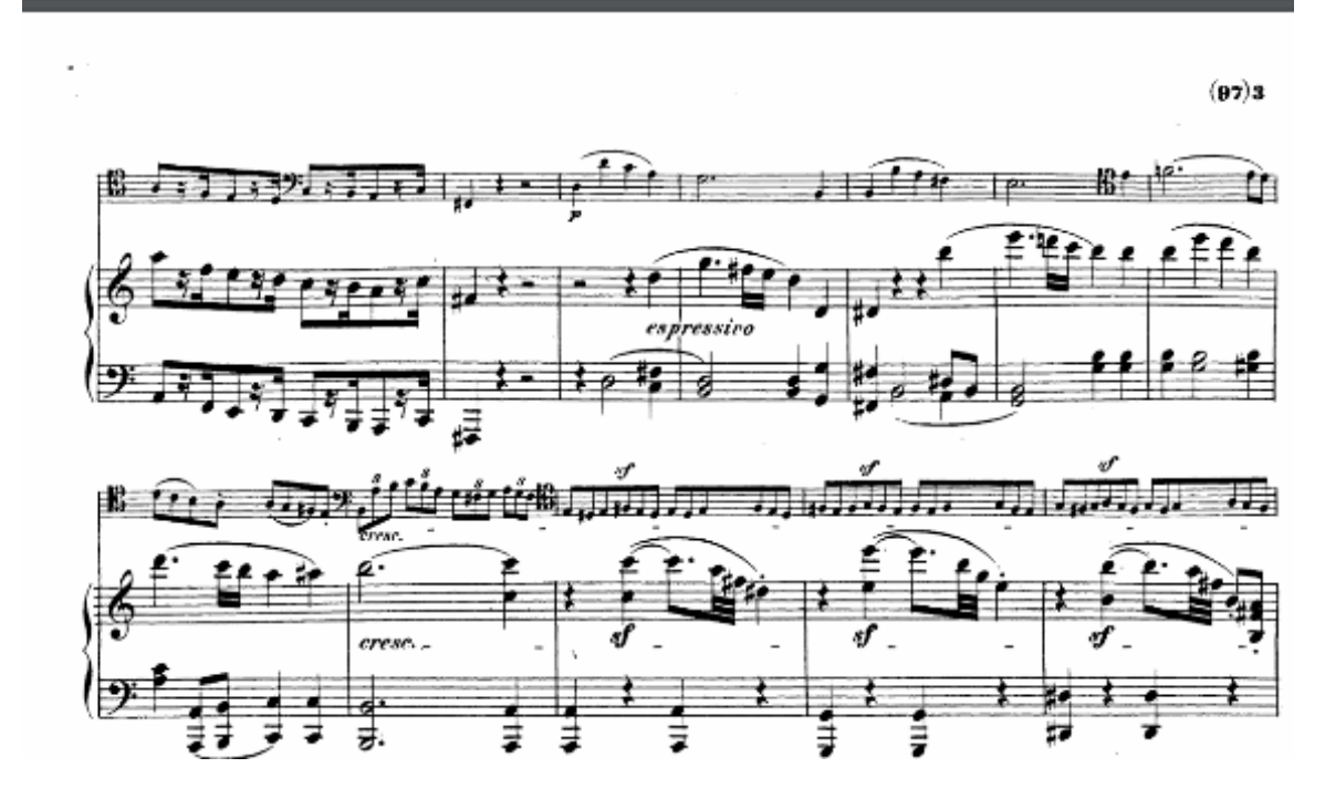
Example 36: Beethoven Sonata for Piano No. 4 in C-Major and Cello, Op. 102 No. 1 – Mvt. 1 (mm. 28-33)<sup>84</sup>

Unlike Beethoven, Chopin's sonata does have a more developed secondary theme (Example 37), or at least something that could be considered a second thematic germination point from which variations and thematic augmentations are spawned and