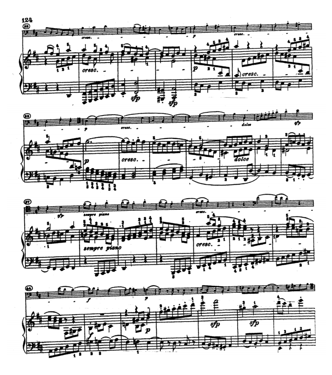
Example 42: Beethoven Sonata for Piano and Cello in D-Major, Op. 102, No. 2 – Finale (mm.22-50)93

It is important to note that the last movement of Beethoven's Op. 102 No. 2 is in the style of an 18<sup>th</sup>-century imitative fugue, and that it is inherently conversational. It may initially appear that Chopin takes a much different approach in his conversational dialogue between instruments and that it is unrelated to Beethoven's approach. However,