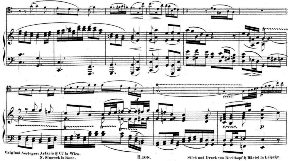
Example 31: Beethoven Sonata for Piano and Cello in No. 4, Op. 102 No. 1 - First Movement (mm. 11 - 20)<sup>73</sup>

The initial thematic germ is softly spoken, in a thematic and dynamic sense. With the instructions of piano and dolce , it would appear to announce itself with the same