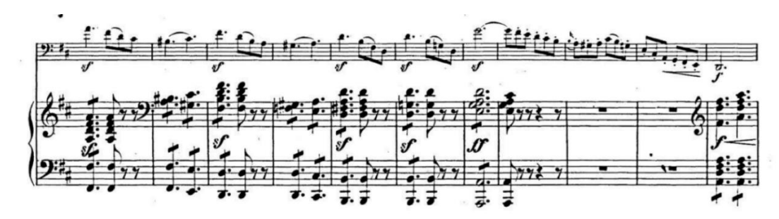
Example 22: Mendelssohn Sonata for Piano and Cello No. 2 in D-Major, Op. 58 – First Movement<sup>52</sup>