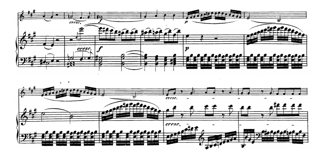
Example 17: Beethoven Sonata for Piano and Cello No. 3 in A-major, Op. 69 – Fourth Movement<sup>46</sup>