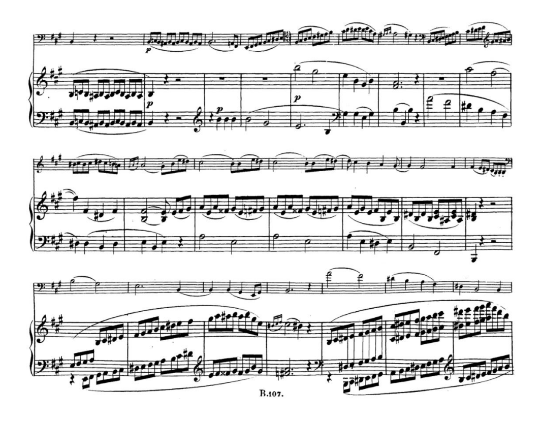
Example 8: Beethoven Sonata for Piano and Cello No. 3 in A-major, Op. 69 – Secondary Theme<sup>17</sup>

Johannes Brahms famously lamented, "you have no idea how it feels to hear behind you the tramp of a giant like Beethoven." These sentiments would be impossible to overstate, as every composer following the great bridge between the Classical and Romantic eras struggled to find their own voice in whatever genre Beethoven had touched. British cello virtuoso and musicologist, Steven Isserlis, writes of Beethoven's A-major Sonata that "every theme was perfectly conceived for both instruments," and that in writing it he "had invented a new genre." Today, we view op. 69 as a pivotal moment in the history of chamber writing. Likewise, its impact was felt by any who were