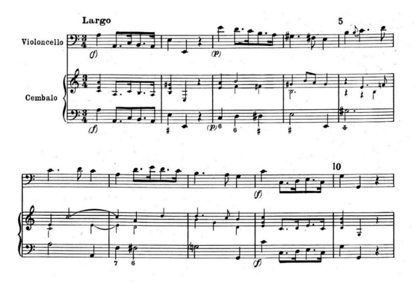
Example 1: Vivaldi Sonata for Cello in A-minor, RV 43<sup>2</sup>

Luigi Boccherini's compositional style also favors the solo cellist, but differently than Vivaldi. In terms of counterpoint and interplay between soloist and continuo, the parts are more interdependent and engaging, but still lacking in true melodic equality. A 1968 article by Eve Barsham notes the prevalence of Alberti bass beneath the solo cello and a maturity in how he develops thematic material, but no mention is made of equal treatment among parts.<sup>3</sup> This is illustrated in Example 2, where it can be seen that the two parts in his Cello Sonata No. 3 in C-Major, G. 6 (c. 1768) do not share equal ownership of the melody. Boccherini's sonatas were novel for their time, but they were clearly solo works for cello rather than an equally balanced effort between the two performers, thus exhibiting a total lack of melodic equality. It is worth mentioning that the accompaniment in Boccherini's sonatas is not written for keyboard, but rather for cello obbligato. Still, it illustrates how unbalanced chamber music for cello was prior to Beethoven.