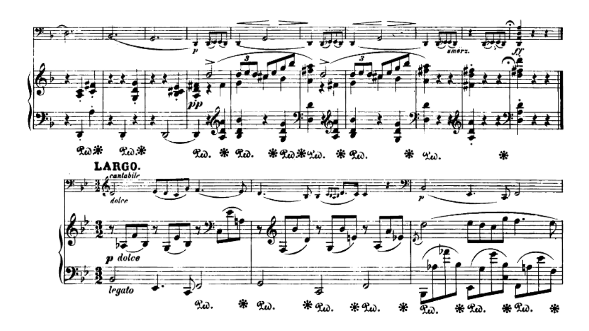
Example 39: Chopin Cello Sonata in G-minor, Op. 65 - Mvts. 2 and 389