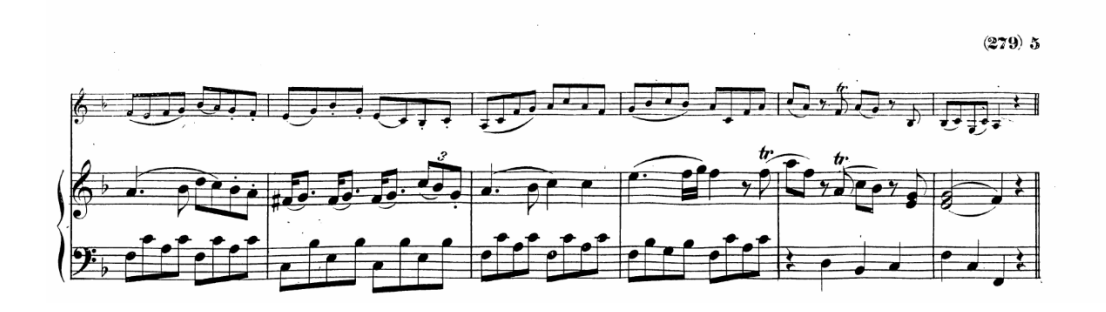
Example 10: Mozart Sonata for Piano and Violin, No. 43 in F Major, K. 547 - Recapitulation<sup>23</sup>

Mendelssohn's violin sonatas also cannot be overlooked, as they also exhibit equal melodic distribution. After the violin's cadenza-like introduction in his F-minor Sonata, Op. 4 (1833), the piano introduces the main theme at allegro moderato . The violin enters 12 measures later and repeats the same theme verbatim (Example 11). This and the previous example from Mozart show that melodic trading is not specific to Beethoven or music written for cello, but that it is a hallmark of the Classical Era of composing in general. It makes sense that some Romantic composers, like Mendelssohn, who were noteworthy for their Classical style of writing, would also choose to use such a texture. What is specific to Beethoven is total equality between piano and cello, as exemplified in the Op. 69 sonata. For this reason, it is not possible to link Mendelssohn's usage of melodic counterbalance in his Op. 58 sonata exclusively to Beethoven.