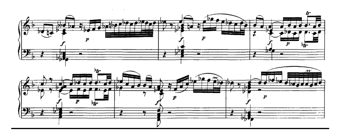
Example 26: Bach Chromatic Fantasia and Fugue, BWV 903 – Recitative Section<sup>61</sup>

recitative section; even Bach himself marks it this way in the score.<sup>59</sup> Bach employs the use of a falling, eighth-note motive placed intermittently throughout the final section of the Fantasia (Example 27). This is a common occurrence in Baroque music in general and is often referred to as a sighing motive.<sup>60</sup> As we saw in Example 25, Mendelssohn uses the exact same motive in a very similar manner, also placing it intermittently throughout his own recitative.