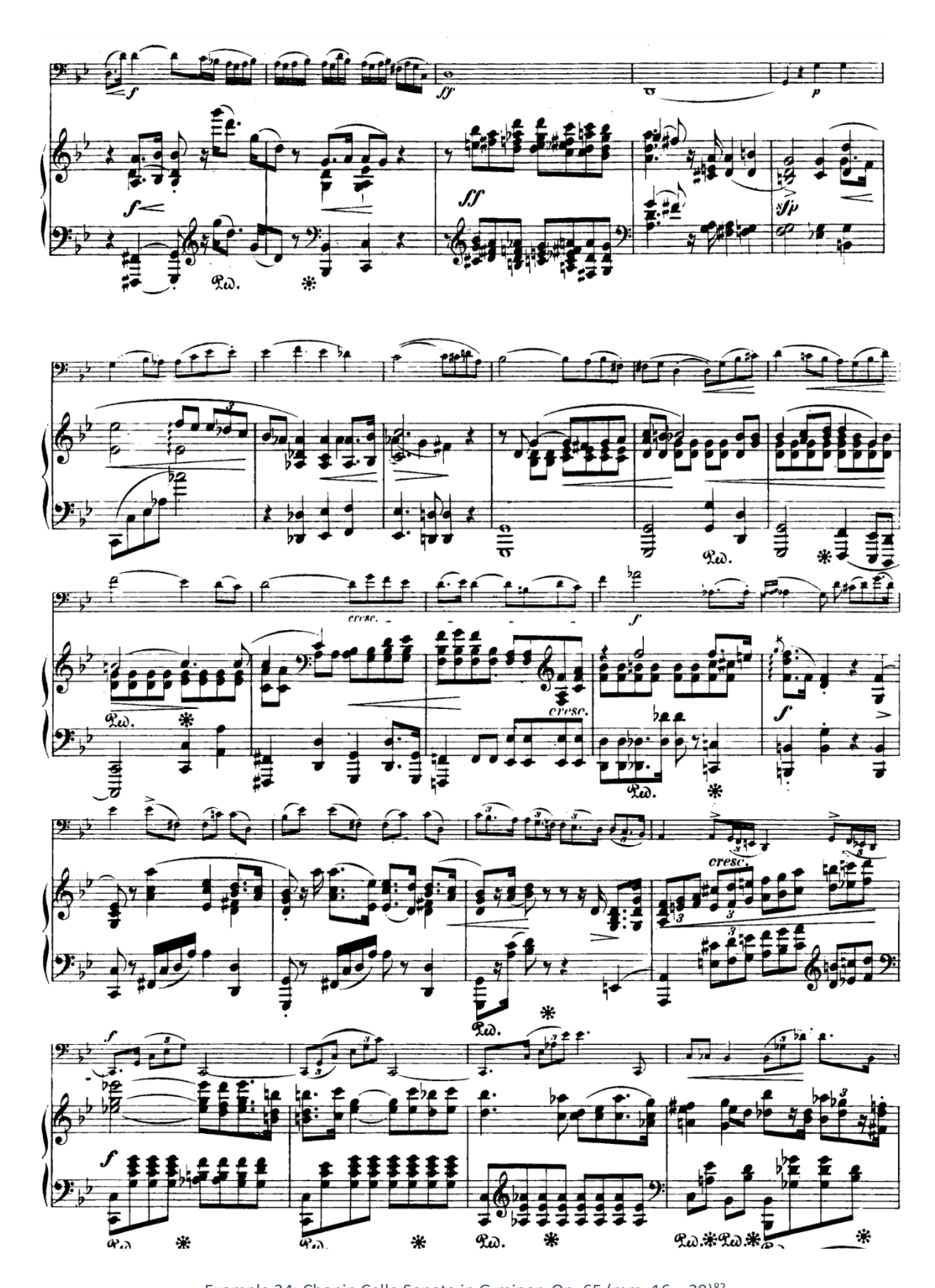
Example 34: Chopin Cello Sonata in G-minor, Op. 65 (mm. 16-39) ^{82}