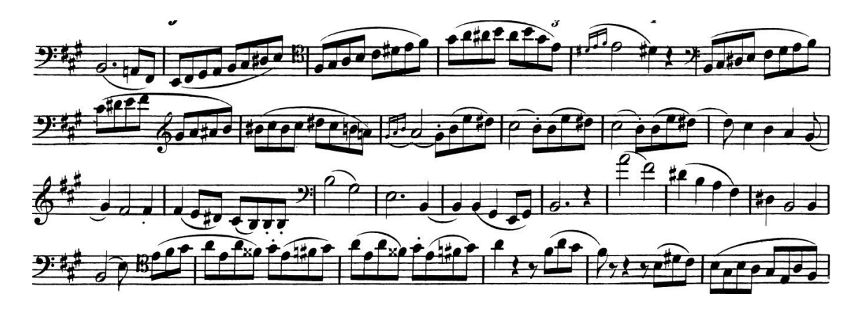
Example 23: Beethoven Sonata for Piano and Cello in A-major, Op. 69 - First Movement<sup>55</sup>

The issue of heroism is also related to the issue of virtuosity within the two works, particularly regarding their secondary themes in their respective first movements. In Example 23, we can see linear, stepwise motion in the solo cello line. From a casual glance, it almost appears simple or even technically facile. What makes it virtuosic is the challenge that arises in creating a musical line and maintaining an accurate pitch center throughout it. One could describe it as musical tightrope walking, where one false move can completely deflate an entire phrase. Also apparent in this example is a hallmark of the classical style of composition. Simple and graceful ornamentations adorn the ends of phrases in the form of turns and call-and-response figures, such as in the second and third measure of the last line.