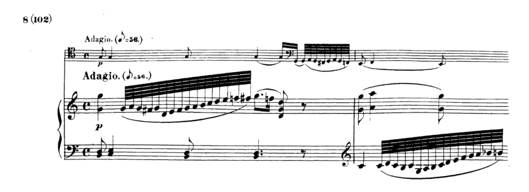
Example 38: Beethoven Sonata for Piano and Cello No. 4 in C-Major, Op. 102 No. 1 - Mvts. 1 and 287

While Chopin does not incorporate cyclical themes throughout the four movements of his cello sonata, he does end the second movement in a way that is similar to Beethoven's rest with a fermata above it (Example 39). However, it is not the