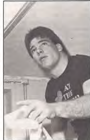
■ A Red Shirt member repairs a ceiling.