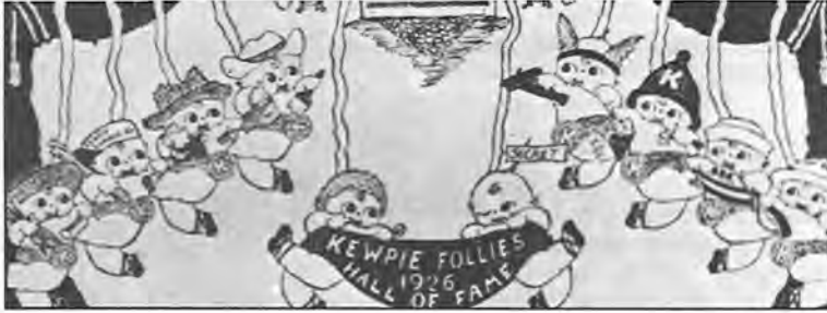
■ The Kewpie Follies of 1926

The club membership rules were different, too. At first, there was no formal rush nor were there limits on how many new members the clubs could recruit. In fact, since the girls received bids from all the clubs, they could choose from among the Kewpies, the EEEs, the WCFs, the Hi-Hats and Gamma Phi's. The clubs