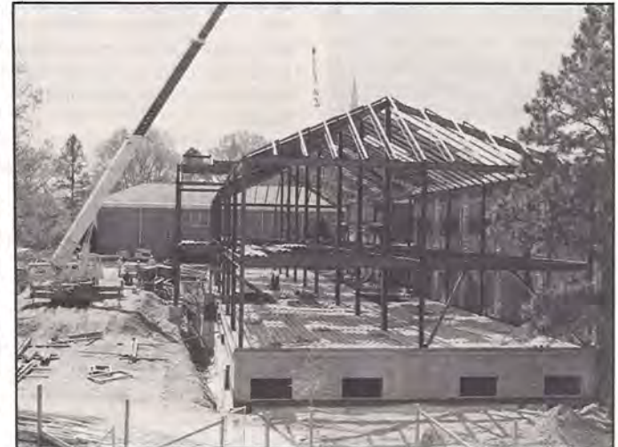
■ The entrance to Riley Library (left) before demolition began. A truck (center) hauls away debris. Workers (right) erect the framework of the new library.