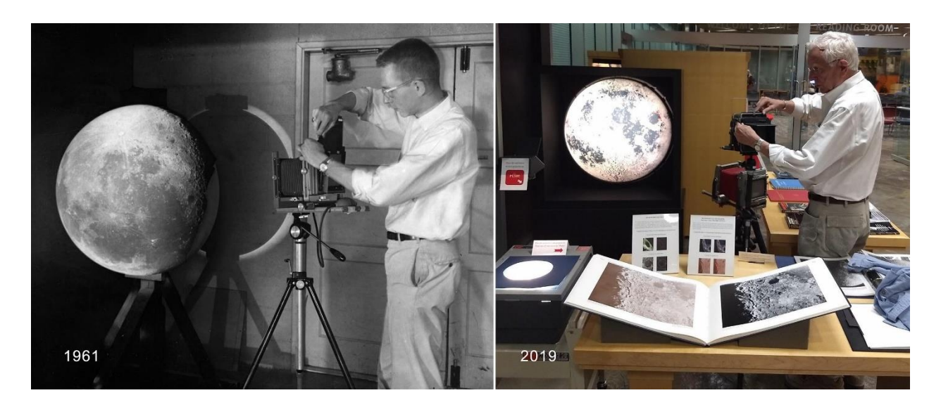
Figure 3. On the left, William K. Hartmann with the precision hemisphere taking photographs for the Rectified Lunar Atlas , 1961. On the right, Hartmann re-creates the image with the display in the Moon exhibit in Special Collections, 2019.

when a Mars-sized planet struck Earth and flung the top layer of the Earth into space, where the debris recombined to form the Moon. The Giant Impact Theory withstood forty-five years of scientific scrutiny and is currently in flux with several modified scenarios.