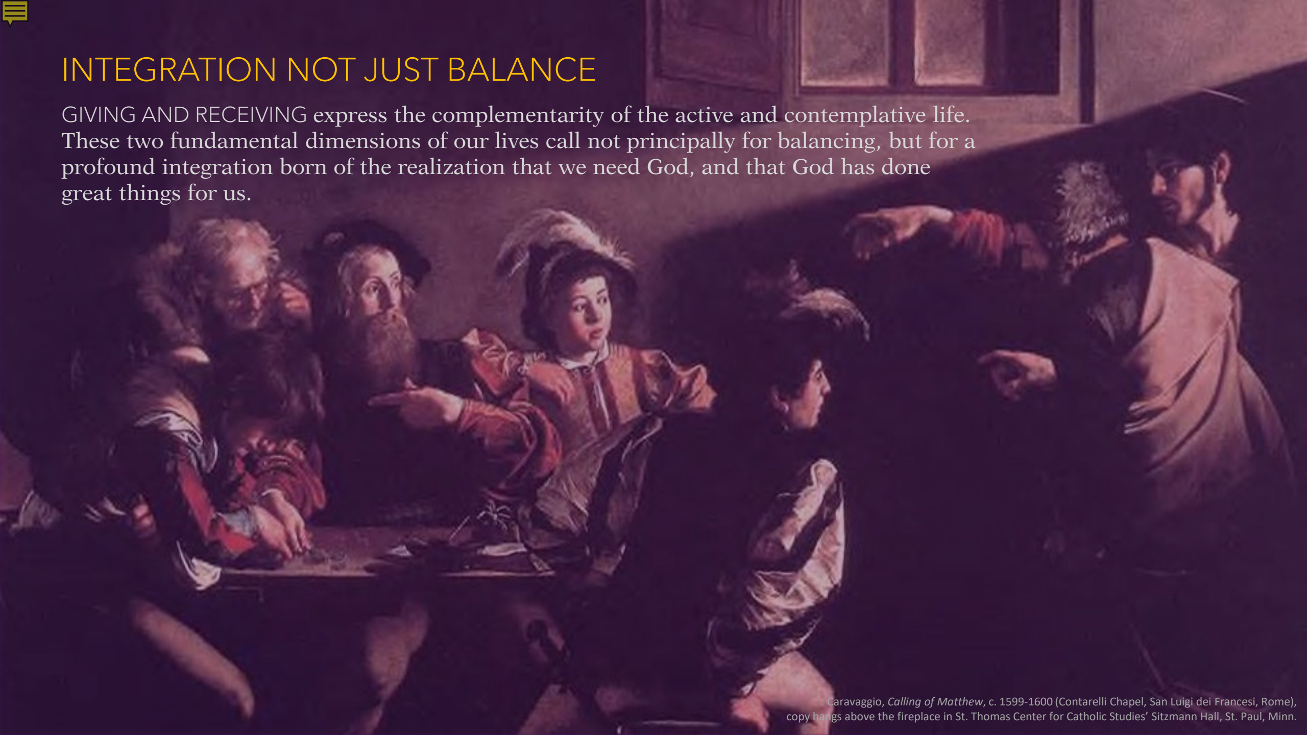
Caravaggio, Calling of Matthew , c. 1599-1600 (Contarelli Chapel, San Luigi dei Francesi, Rome), copy hangs above the fireplace in St. Thomas Center for Catholic Studies' Sitzmann Hall, St. Paul, Minn.

GIVING AND RECEIVING express the complementarity of the active and contemplative life. These two fundamental dimensions of our lives call not principally for balancing, but for a profound integration born of the realization that we need God, and that God has done great things for us.