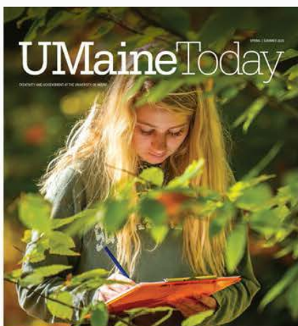
CONIFER CLASSROOM What are the roles of Maine's University Forests?