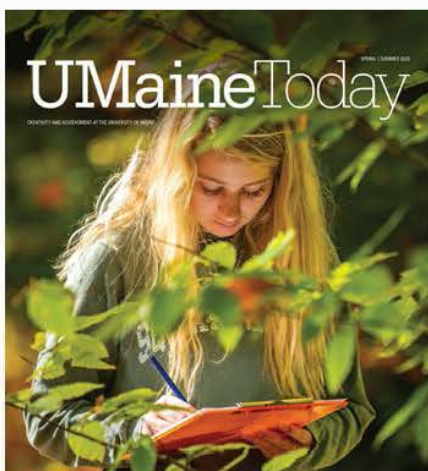
CONIFER CLASSROOM What are the roles of Maine's University Forests?