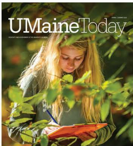
CONIFER CLASSROOM What are the roles of Maine's University Forests?