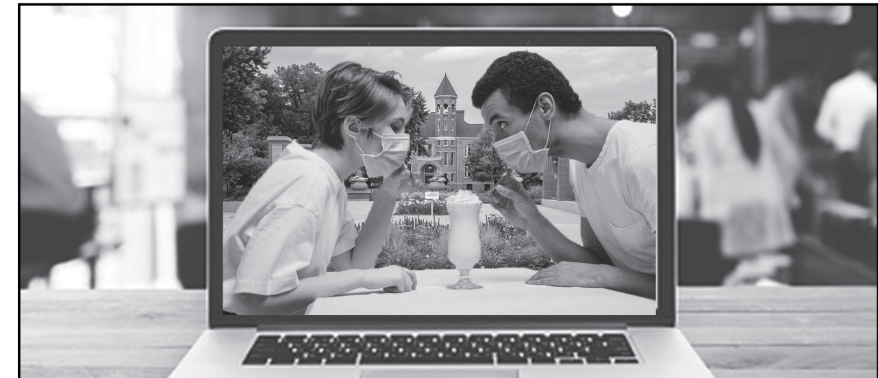
aging what thay look knows?

However, due to COVID-19, we as a campus are required to wear our masks everywhere we go: in classrooms, buildings, dining halls, you name it. Identifying someone when half of their face is