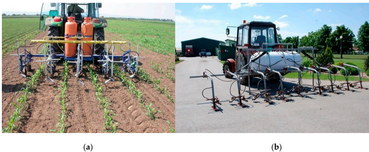
Figure 1. (a) The prototype flame weeder for smaller fields designed in Serbia; (b) The commercial Red Dragon flame weeder manufactured by Flame Engineering, Inc., La Crosse, Kansas, USA.

The third model encompassed the use of a commercial Red Dragon flame weeder (Figure 1b), which was mounted on a 90 kW tractor. The company AD Budućnost has used this machine—Global Seed (Čurug, AP Vojvodina, Serbia) since 2013, accounting for more than 1000 ha of organic maize production [49]. In contrast with the prototype, the Red Dragon flame weeder features an operating width of 8 rows (without inter-row cultivation implements) and an 800 kg propane tank, which contributes significantly to the overall performance [38].