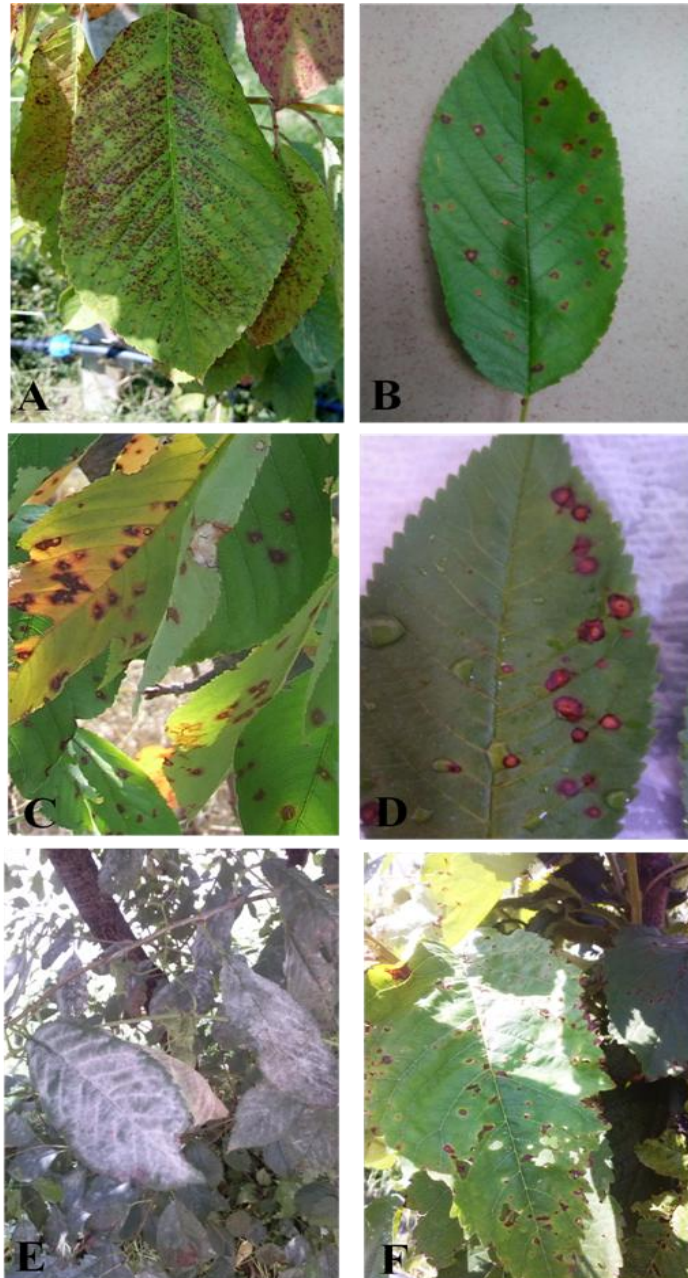
Figure 2. Symptoms on cherry leaves caused by: A - Blumeriella jaapii ; B - Wilsonomyces carpophilus ; C - Mycosphaerella cerasella ; D - Phoma prunicola ; E - Podosphaera clandestina ; F - Pseudomonas syringae pvs. (Ilić R.)