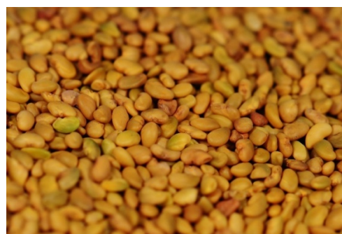
Fig. 2: Cleaned alfalfa seed

The quality of alfalfa seed is determined by a number of parameters (namely germination, purity, moisture, etc.) which depend on several production factors (namely weather conditions of ripening, culture practices, etc) as well as handling the seed after harvest (cleaning and storage). After harvest, alfalfa seed has a purity of about 80 % so it has to be refined, i.e. cleaned. The seed passes through a series of machines that separate impurities such as dry stems, weeds and broken seeds. Alfalfa seed should possess a purity of at least 95 %, up to 2 % of seeds of other types, 0.5 % of weeds (without quarantine weeds), 2.5 % of inert matter, germination of 70 % and 90 % moisture (Službeni Glasnik SFRJ, 47/1987). The color of the seed dictates the quality and therefore the price, so it is better when the seed has a brighter color (Figure 2).