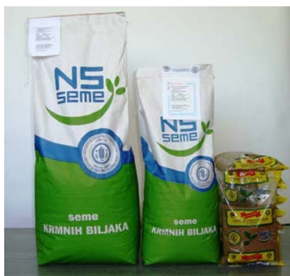
Fig. 1: Packaged alfalfa seed

Alfalfa ( Medicago sativa ) is the most important perennial forage legume due to the yield and feed quality, as well as the area devoted to it both in our country and the world (Karagić et al. , 2011). Provided nutritional value is observed, alfalfa belongs to one of the leading fodder plants in the bulky fodder production. Alfalfa seed represents a very competitive product in the market (Figure 1). The physical and biological characteristics of alfalfa seed contribute to its easy transport from region to region. If properly stored, alfalfa seed retains germination for several years. Due to a low moisture content (up to 9 %), alfalfa seed is susceptible to a relatively small number of pests when stocked. These properties make alfalfa seed very suitable for both domestic and international trade (Karagić et al. , 2011).