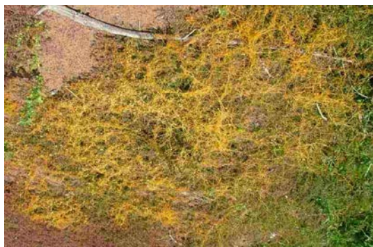
Fig. 3: Dodder infested alfalfa

because it does not have roots or leaves, and does not carry out photosynthesis. Conversely, it sucks nutrients from the host plant. It is the most frequent parasite of clover, alfalfa, juicy vegetables and cereals, although it can also be found on shrubs and some fruits. Dodder fruits are capsules that contain light brown seeds, and one plant can produce up to 3,000 seeds a year. The big problem is the fact that dodder seeds are able to maintain germination up to 12 years (Figure 3). The seeds are similar in shape and size to alfalfa seed and it is hard to isolate them during the primary cleaning using a sieve.