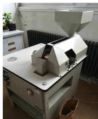
Fig. 5: Laboratory magnetic separator MCC Lilliput