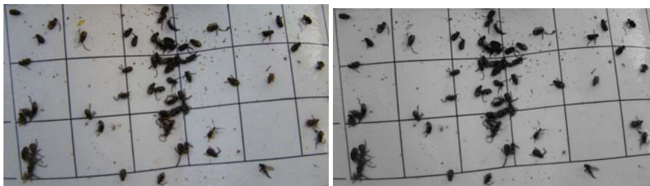
Figure 2. Original (left - a) and image in grayscale mode (right - b) of sticky bases of Diabrotica virgifera sp. virgifera on pheromone trap

The idea was to convert original image (Figure 2) from color to grayscale mode so other color on images or reflection do not have influence on computing area.