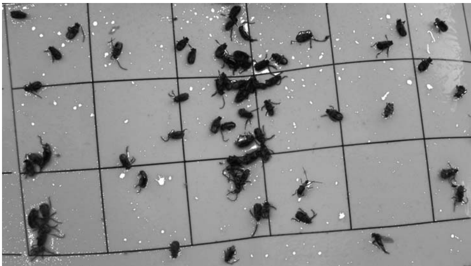
Figure 3. Image of catch insects on sticky bases of Diabrotica virgifera sp. virgifera on pheromone trap with removed smaller objects

Except insects, small impurities could entered in the trap accidentally from the environment and these spots often have black color which means that they may have influence on end result. Next step represented removing impurities and resulting image (Figure 3) was used then for calculating area expressed in number of pixels.