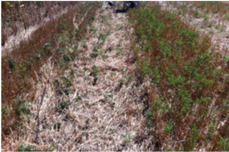
Figure 2. Appearance of plants Ambrosia artemisiifolia L. 20 minutes after treatment