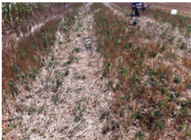
Figure 3. Appearance of plants Ambrosia artemisiifolia L. 40 minutes after treatment