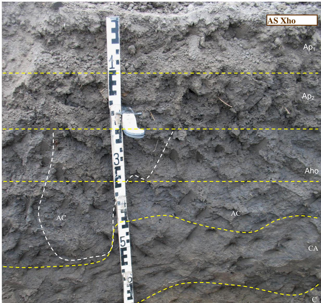
Figure 3 Hipohortic Fluvisols from Barlad greenhouses