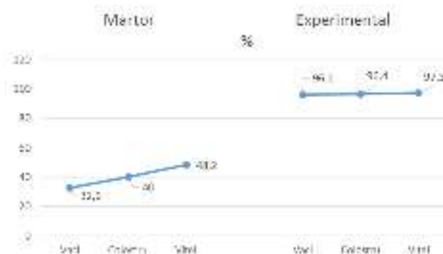
Fig. 2 – Graph of mean values of BoCV expressed as inhibition percentages measured by competitive ELISA from pregnant cow sera, colostrum and calf sera

The values of anti-E. coli F5 (K99) antibodies, expressed as percent inhibition measured with ELISA blocking in the sera of pregnant cows and the sera of calves are plotted in Figure 3. In group M, both in the serum of pregnant cows and in the serum of calves, a minimal presence of anti-E.coli F5 (K99) antibodies was detected, with an average of 0.3% PI cows and 0.2% PI calves, respectively. The differences between group E and group M are statistically significant ( p < 0.001 ), in group E registering an average of 90.9% PI in the case of pregnant cows serum and 97.4% PI in the case of calves serum.