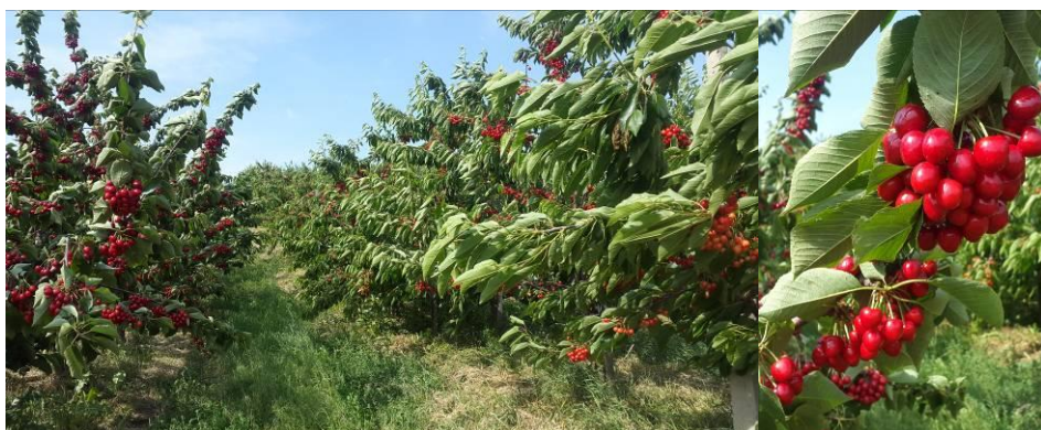
Fig. 2 Aspects from the experimental field

Nine of the most promising selections obtained in the last years breeding programs and most cultivated in Romania (Musacchi et al. , 2015) were screened on