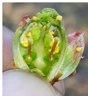
Fig. 3. Damages caused by late frost

In the last years the change of climatic conditions are affecting trees growing and development, resulting early flowering seasons, followed in some years by lack of rain or rainy periods and extreme temperature fluctuations during fruit development or. The impact of unfavourable conditions is most evident in early ripening cultivars, due to high fruit drop and fruit cracking or the fruits may remain small in size.