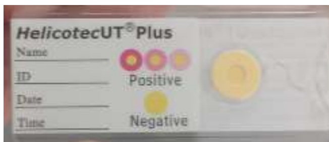
Fig. 1. Rapid test to detect urease activity eliminated by Helicobacter pylori

Rapid tests in the gastric mucosa detect the presence of urease eliminated by the bacterium, but the specificity is reduced due to the administration of metronidazole.