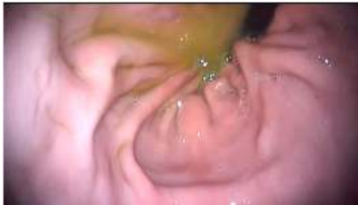
Fig. 3 - Endoscopic retroflexion maneuver to visualize the small curve - normal appearance