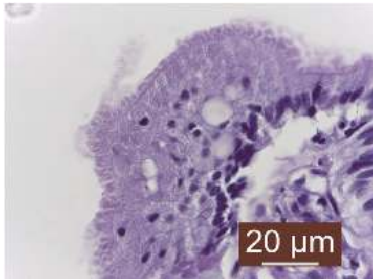
Fig. 8 Epithelial dysplasia (preneoplastic lesion) of the mucosa (intestinal epithelial cells are unorganized, with loss of polarity and arranged in several layers)