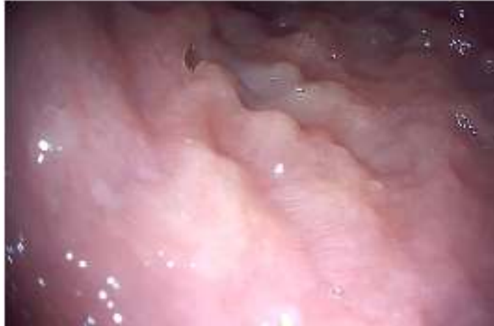
Fig. 5 Endoscopic image of the duodenal mucosa less affected - areas with cilia are observed.

Rapid testing directly from the gastric mucosa for the detection of Helicobacter pylori had a false negative result, as histological examination revealed helical bacteria in the duodenal (Figure 6) and gastric (Figure 7) submucosa.