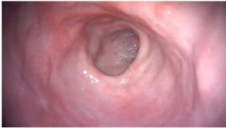
Fig. 2 - Pyloric orifice with slightly modified mucosa - reddish areas appear, with an inflammatory appearance (congestion)