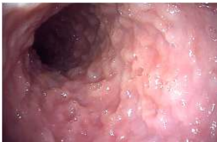
Fig. 4 Endoscopic image of the first duodenal third - proliferative pathological aspect of the mucosa, with ulcers and the absence of the intestinal cilia.