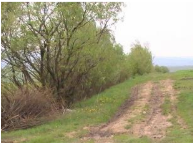
Figure 2 Desilted channel and invaded by woody vegetation