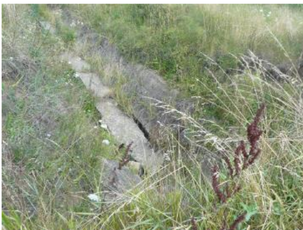
Figure 3 Tail-race channel made out of concrete is degraded

The absence of maintenance work, inappropriate agricultural practices, as well as certain natural factors (especially the relief and torrential precipitation) led to the degradation of the hydrotechnical constructions (Beasley R.P. et al , 1984, Ioniță I., 2000, Mihaiu Gh., 1983). Of course, with the degradation of these constructions,