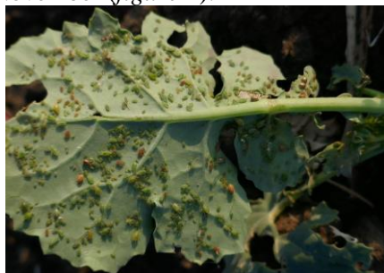
Figure 1 Greed peach aphids ( Myzus persicae ) on OSR lower side of the leaf, 12.11.2018

In autumn of 2018, at the experimental field from NARDI Fundulea, it has registered a high population of green peach aphids at OSR crop. First aphids were observed in the field on 29 October. The untreated variant has registered 24.45 aphids on the lower side of the OSR leaf ( table 4 ). Aphids density from the untreated plants increasing in the first 15 days of November, arriving at a maximum peak of 243.35 aphids/leaf on 12 November ( figure 1 ).