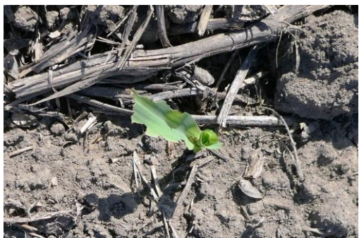
Figure 3 Maize plant attacked by T. dilaticollis

%). Highest statistical difference comparative with untreated variant (p<.05) was registered in case of variant treated with imidacloprid (seed treatment). In climatic conditions of the year 2017, saved plants percent presented higher values comparative with 2016. However, there weren't statistical differences between experimental variants (p < .05), even if the higher saved plants percent value it has registered in case of imidacloprid seed treatments. In conditions of the year 2018, saved plant percent ranged between 81.03 % in case of untreated variant and 87.01 % in case of variant treated with imidacloprid. There weren't statistical differences (p<.05) between untreated variant and variants treated with neem oil or spinosad active ingredients, both like seed treatment (10.0 l/to) and foliar application (0, 15 kg/ha).