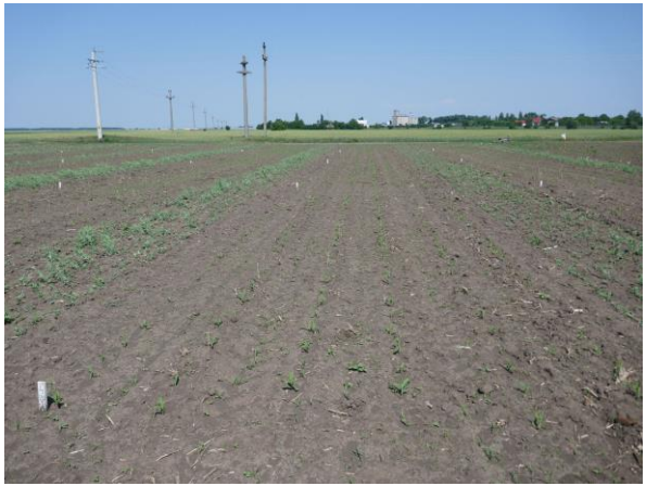
Figure 1 Experimental plots with seed treatment effectiveness assessments at NARDI Fundulea

Data from tables 1 and 2 show that climatic conditions registered at NARDI Fundulea, in April and May, were atypically. In 2016, average air temperature registered in April was higher than multiyear average and lower then multiyear average in May. In 2017, average air temperature was bellow multiyear average, both in April and May. In 2018, average air temperatures registered in April and May was higher than multiyear averages, with a positive deviation of +4.7 °C (April) and +2.7 °C (May). Rainfalls amount registered at meteorological station from NARDI Fundulea was higher than multiyear average, both in April and May, in 2016 and 2017. However, in 2018 climatic conditions from high period were different. In April it has registered only 3.8 mm comparative with multiyear average (59.0 mm). In May (2018) registered rainfalls amount was below multiyear average. From all three years presented in this study, 2018 was the most favorable for maize leaf weevil attack, because of high temperatures and drought.