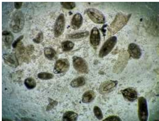
Fig.3 Diplostomum von Nordman, 1832 found in the lens of the silver carp

form and the chronic form. The acute form, caused by cercariae , is very dangerous for juveniles. Punctate hemorrhages on the skin and mass death of juveniles are specific for the acute form. The chronic form, which is also called worm cataract , is caused by metacercariae , and due to local inflammatory processes, eye cataract occurs, as a result of which fish feeds poorly, becomes cachectic and dies.