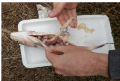
Fig.4 Plerocercoids of Ligula intestinalis found in the abdominal cavity of a silver carp

In a pond of Fălești district, a case of massive infestation of the silver carp with plerocercoids of the Ligula intestinalis was detected (fig.4). The prevalence was high, above 90%, with intensity of invasion of 3 and more plerocercoids per fish. In ligulosis, fish swim more on the surface of the water, being prone to be eaten by fish-eating birds. The plerocercoid, which parasitizes in the abdominal cavity, by the pressure it generates, causes atrophy of the internal organs, such as gonads, becoming sterile, or penetrates the wall of the abdominal cavity that leads to the death of fish.