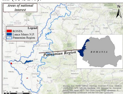
Fig.1 Distribution of protected areas of national interest in the Pannonian Region, processed after http://www.mmediu.ro/articol/date-gis/434

It results in a total area covered by protected areas of 340634.70 ha, which represents 24.32% of the Pannonian bioregion. However, due to partial or total overlapping of different categories of protected areas, the actual area is 217409.01 ha (15.52%).