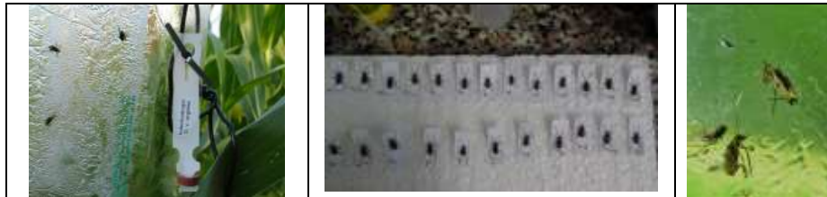
Figure 2 Adults Diabrotica captures on traps in different hybrids of corn: beetles caught on pheromone trap (Csalomon® type) (left); males and females collected from a trap (center); beetles on detail (right)

T 1 T 2 T 3 , pheromone traps (Csalomon® type)