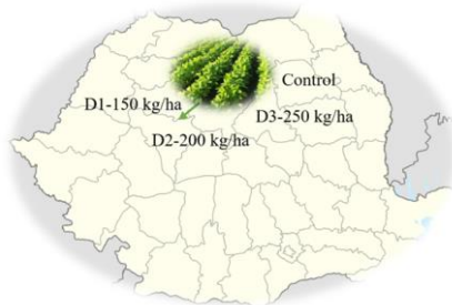
Figure 1 Study location and fertilization levels

(Microsoft, USA) highlighting differences between studied genotypes and applied doses.