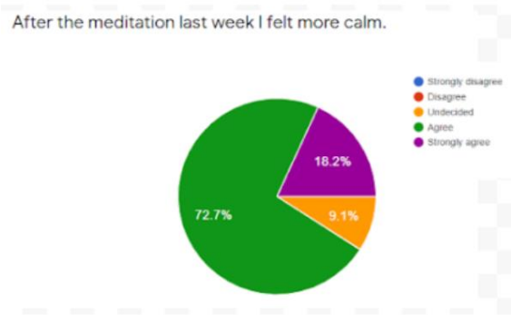
Figure 1 Results from "After meditation last week I felt more calm"

This week I noticed that I was able to redirect my emotions during times of stress