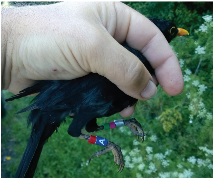
Figure 1. Adult male specimen of Common Blackbird ( Turdus merula ) marked with a combination of aluminium and coloured plastic rings. 27th July of 2018. Bárdudvarnok

We considered that the bird left the previous year's territory if the bird did not occupy an area within 0-15 meters of the nesting territory of the previous year again in the following year (MÁTRAI et al. 2012).