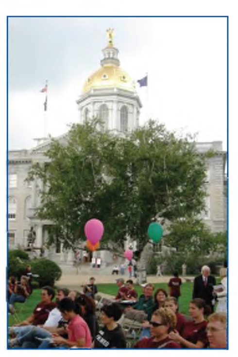
Volunteers gathered for the Merrimack County Region's Day of Caring and campaign kickoff luncheon on the State House lawn in Concord.