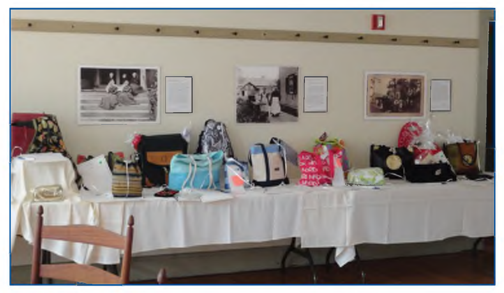
The Upper Valley Region's Women's Leadership Council held a Power of the Purse event in September. Money raised during the silent and live auction of celebrity, luxury and global handbags will support various Women's Leadership Council initiatives. The event was sponsored by Jake's Market & Deli, The Couch Family Foundation, Mascoma Savings Bank, The Sally Rutter Group, Lake Sunapee Bank, Citizens Bank and Citizens Private Bank & Trust.

2011 was a challenging yet rewarding year. As many continue to face economic uncertainty, this is a time of increased need for the individuals and families that depend on the programs Granite United Way administers and funds. In this report you will read about our many successes including our Volunteer Income Tax Assistance (VITA) programs, leadership on 2-1-1 with the United Ways of NH and United Ways of Vermont, efforts on Homeless Services and, of course, our traditional role of funding partner programs.