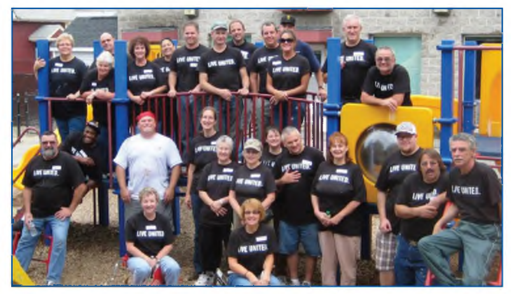
Volunteers from Velcro USA Inc. spent the day at Easter Seals Child Care & Family Resource Center in Manchester cleaning toys (indoor and outdoor), building storage space and working with individual students as classroom assistants.