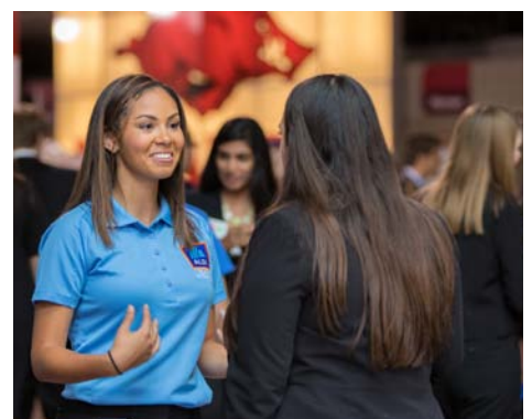
Business Career Fair