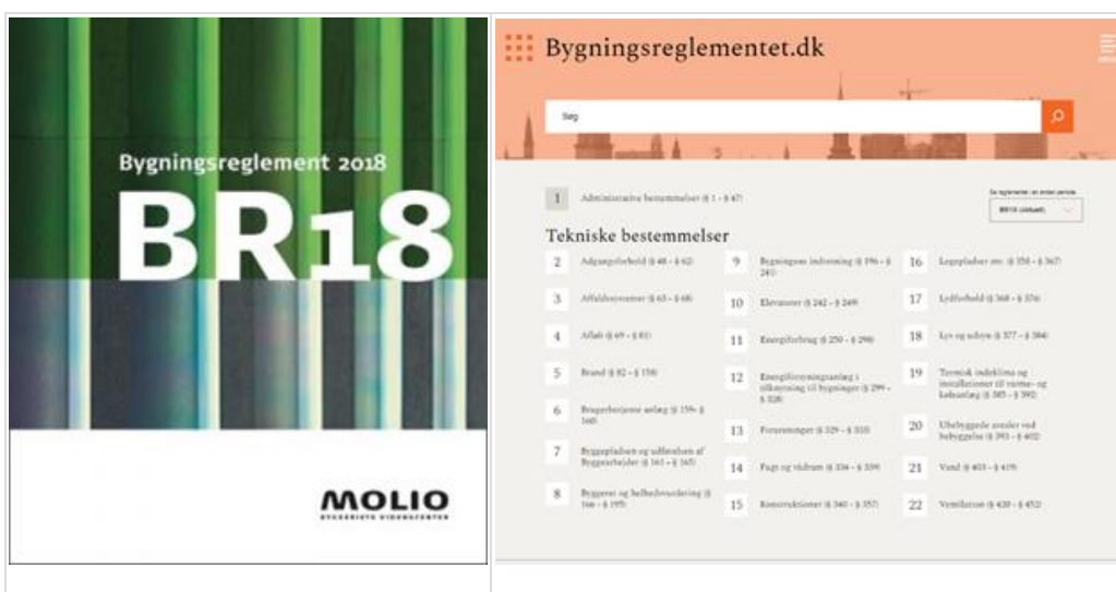
Figure 1. Danish Building Regulations 2018. The Danish Building Regulation (current and historic) can be found at: http://bygningsreglementet.dk ( http://bygningsreglementet.dk ).

In July 2016, the previously voluntary 'Low-energy Class 2015' became final and binding and was renamed the 'Danish Building Regulation 2015 (BR2015)'. The BR2015 sets minimum energy performance requirements for all types of new buildings. In addition to the minimum requirements, the BR2015 also sets requirements for a voluntary low-energy class, 'Building Class 2020' (equivalent to NZEB level at that time). In 2018, the energy performance requirements were slightly changed, primarily due to upgrades of the primary energy factors and the calculation procedure, and were implemented in the Building Regulation 2018 (BR2018). The voluntary class of 2020 was evaluated to be beyond the cost-optimal level and will remain a voluntary low energy class with a small change in the requirements due to updated primary energy factors.