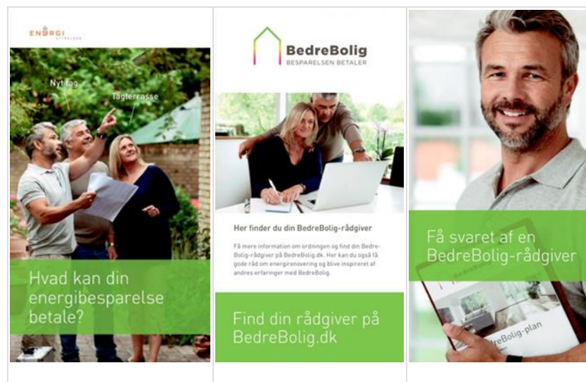
Figure 2. The 'Bedre Bolig' ('BetterHouses') campaign - www.BedreBolig.dk ( https://spareenergi.dk/forbruger/vaerktoejer/bedrebolig ).