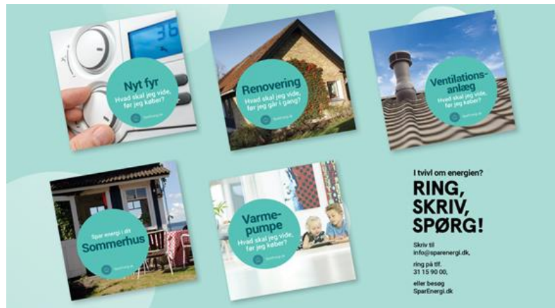
Figure 3. Sample of popular guides targeting private households.

The Danish Energy Agency's website www.SparEnergi.dk ( http://www.sparenergi.dk/ ) is the backbone of communication with end users concerning energy efficient solutions, both in private households and in public and private enterprises. The website contains a variety of tools, information and knowledge that supports energy saving. The Danish Energy Agency also offers free-of-charge telephone support and email advice, as well as information activities about available energy-consulting services for private households.