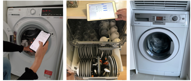
Figure 2: Community Energy Planner used in situ. From left to right, Household C looking at recommendations for when to wash dirty clothes, Household A looking at recommendations to start the dishwasher, and Household F using the timer function on their washing machine to make the best of the recommendations.

The first interview was a preliminary interview and an introduction to the study. The interview was held with both adults in each of the household. This preliminary interview started with a monologue followed by questions regarding demography, environmental standpoint, electricity knowledge and how chores were distributed within households. The participants were also given a thorough guide of the app, and we provided assistance to install the app through video calls. During this, participants had the opportunity to ask questions about the app and the study itself. We explained