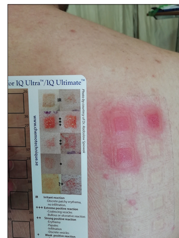
Figure 2: Extreme positive reactions were found during patch testing to Vitrebond™ and Vitremer™