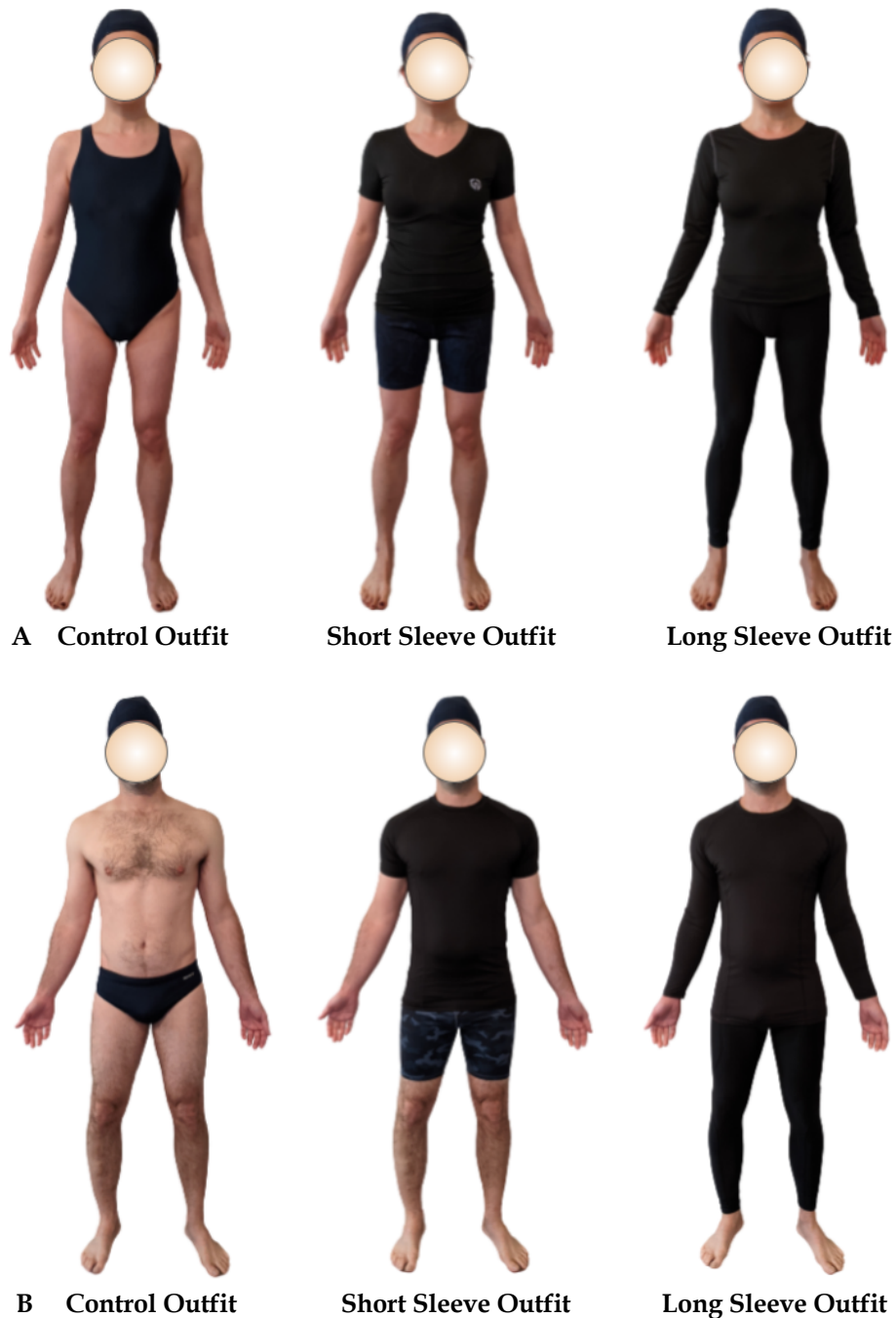
Figure 1. Protocol outfits with spandex swim caps used for A) females and B) males.

were asked “How comfortable were you wearing each outfit? Please rate your comfort with 1 being least comfortable and 10 being most comfortable.” Participants rated their comfort after changing into their own clothes after testing was completed with all three outfits.