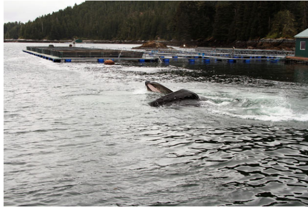
Figure 2. Humpback whales feeding in front of saltwater holding pens for salmon after a release in May 2014.

For observations conducted after the final release, an additional covariate (f.release) for the number of elapsed days since the last release was included.