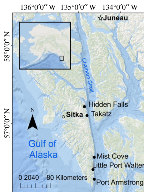
Figure 1. Participating hatchery release sites on Eastern Baranof Island along Chatham Strait. Release sites are shown with dark dots. Cities Juneau and Sitka are shown for reference.

collection. Behavioural observations were conducted at each of the five release sites over 6 years (2010–2015). Each site was systematically sampled twice a day, once in the morning and once in the afternoon. Observation times were selected by observers at the beginning of each season and remained consistent throughout the season to prevent biasing observations towards low-probability events. Whale observations outside of the predetermined sampling times were designated separately as opportunistic sightings. Observations were to begin about a week prior to releases and conclude one to two weeks after releases, when possible. Observations were recorded on standardized forms, with information on humpback whale presence, abundance and behaviours (sleeping/logging, breaching, surface feeding), as well as the presence of other possible salmon predators. This list was modified from a list of barriers compiled by the Glacier Bay Humpback Whale Monitoring Programme (C. Gabriele 2017, personal communication) to include net pens and docks in addition to surface, shoreline, tide-rip and kelp. Observers also noted the timing, location, species, abundance, age and mass of juvenile salmon released. During the coho salmon release at Hidden Falls in 2014, photography and videography were used to document feeding events (Go Pro Hero 4).