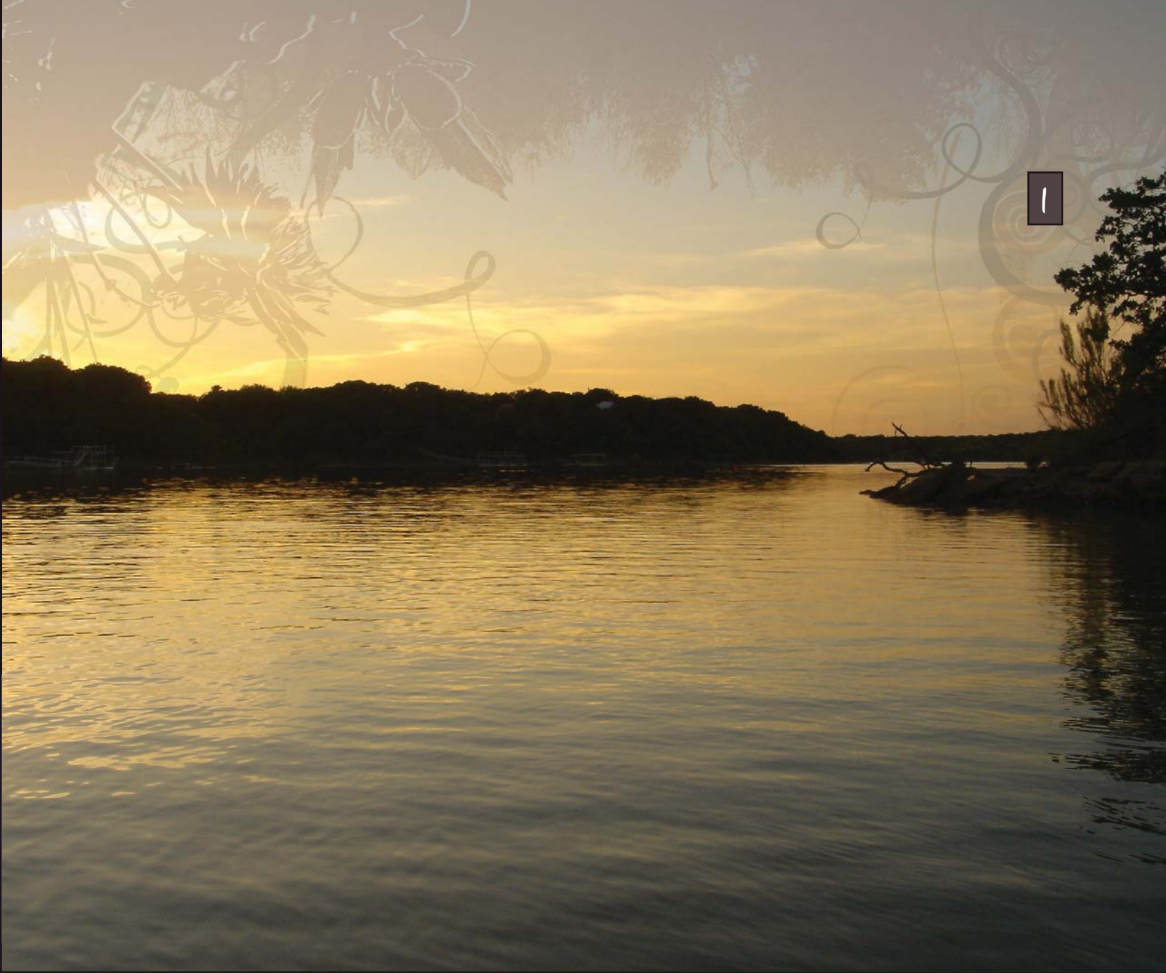
1. Sunset over Lake Brownwood.