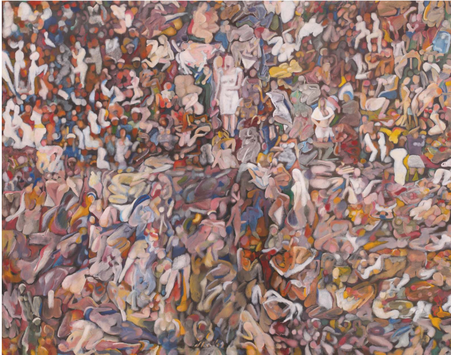
DLN Reddy | Enamel on canvas | 66" x 84" | 2008