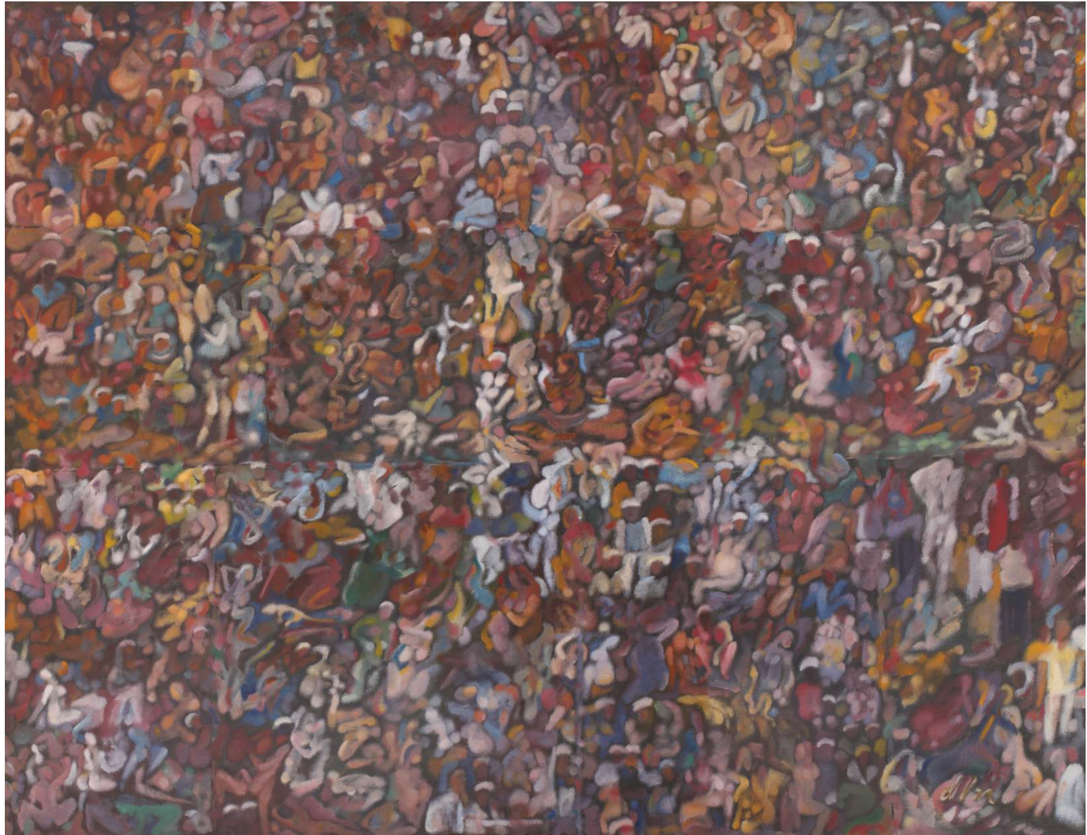
DLN Reddy | Enamel on canvas | 66" x 84" | 2008