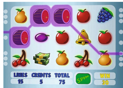
Fig. 1 Examples of near misses and losses disguised as wins (LDW). In the top row , two forms of near misses are presented: ( left ) a 3-reel slot machine with a near miss above the payline; ( right ) a near miss on a 5-reel slot machine (highlighted in black ). In the bottom row , a multiline EGM with 15 playable lines ( left ) is presented and an example of an LDW ( right ). In this example, by betting 75 credits, on 15 lines at 5 credits each, the player’s win of 30 is 45 credits lower than the cost of play, presenting as a LDW

on some of the lines, but not enough to make an overall win. The EGM’s use of winning sounds and winning animations appear to have a strong influence on a player’s urge to continue playing, masking the overall loss (Dixon et al. 2010).