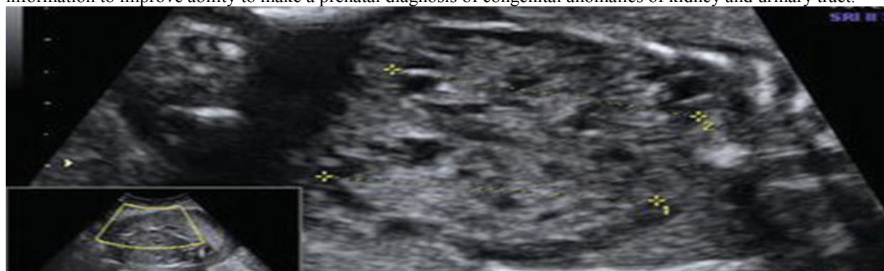
Figure 2. Fetal polycystic kidney disease

Antenatal diagnosis most often follows using ultrasonography; however, further genetic diagnosis may be made employing a range of testing approaches. Family history and pathologic examination also provide information to improve ability to make a prenatal diagnosis of congenital anomalies of kidney and urinary tract.