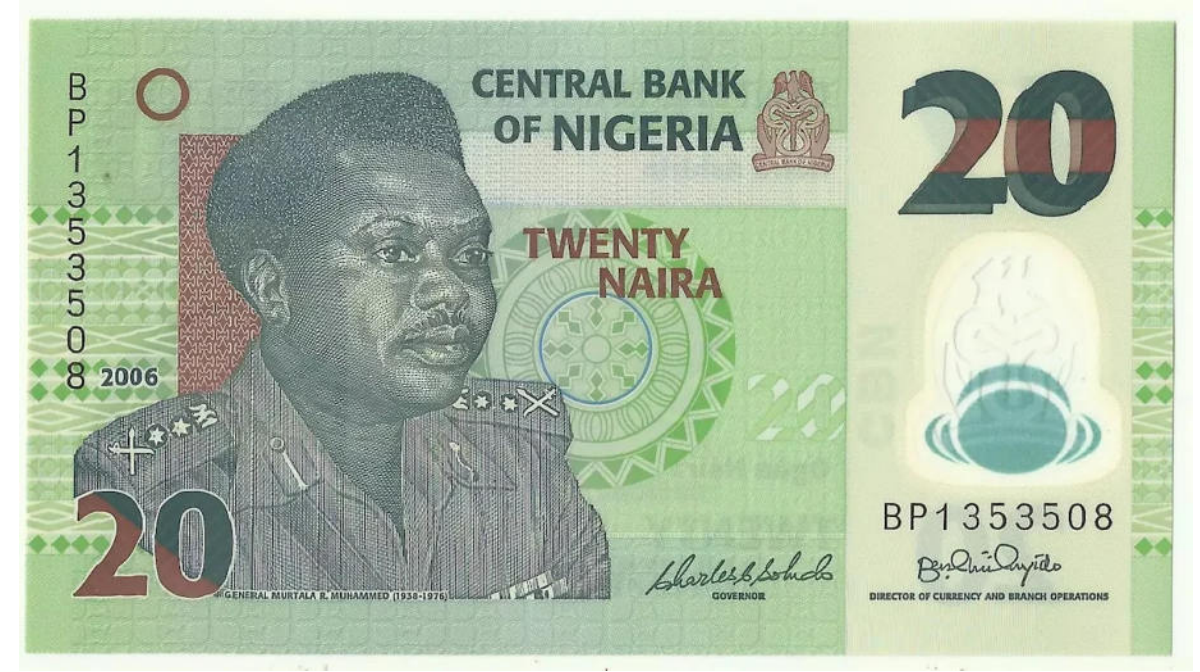
Figure 1.4: Twenty Naira Note (Nigerian Paper Currency)