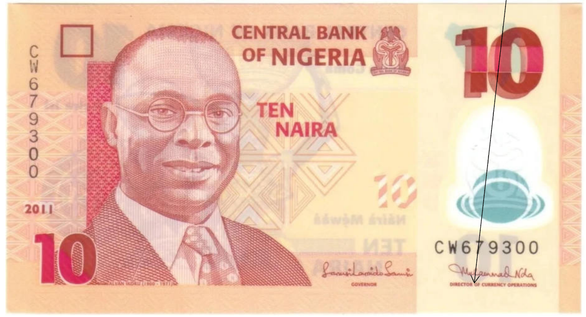
Figure 1.3: Ten Naira Note (Nigerian Paper Currency)