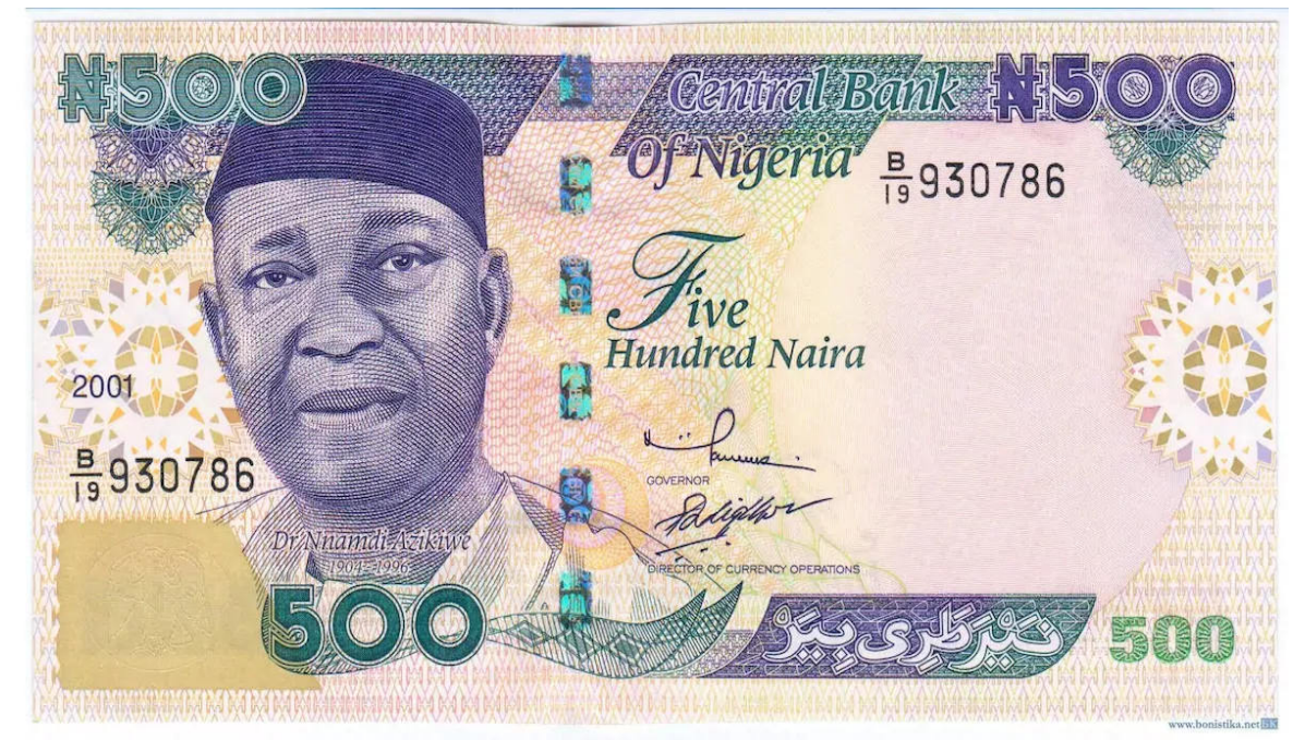
Figure 1.8: Five Hundred Naira Note (Nigerian Paper Currency)