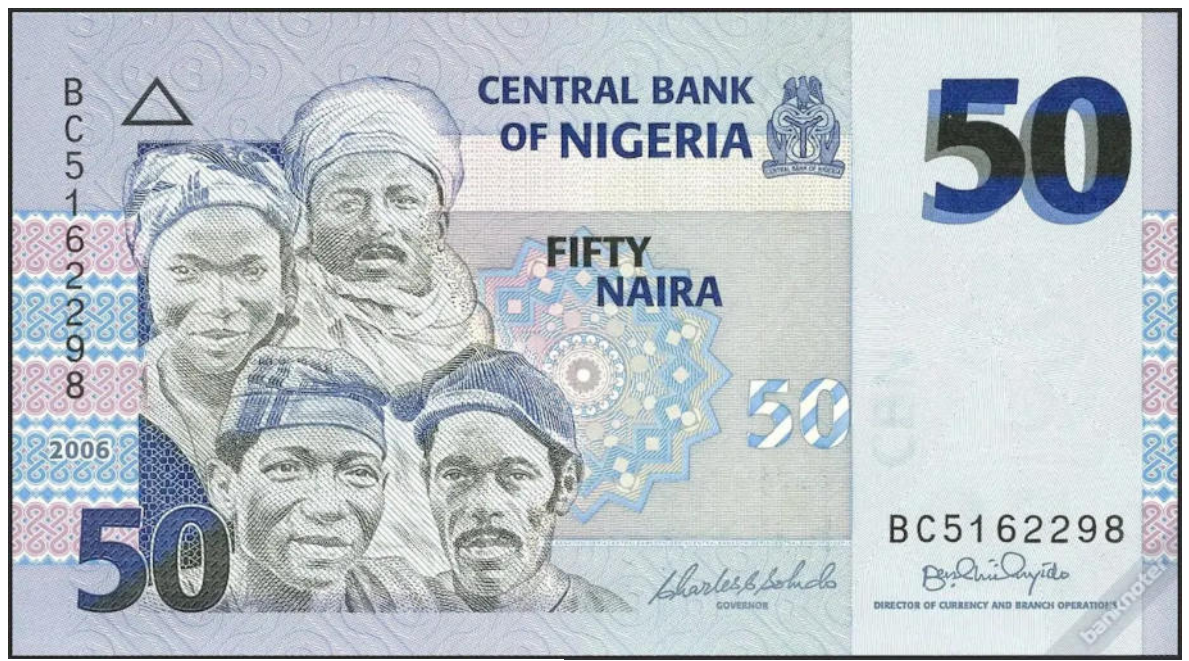
Figure 1.5: Fifty Naira Note (Nigerian Paper Currency)