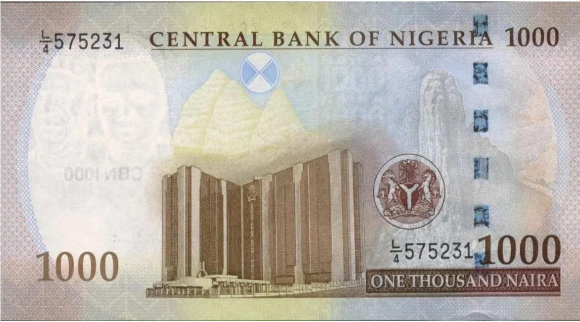
Figure 1.9: One Thousand Naira Note (Nigerian Paper Currency)