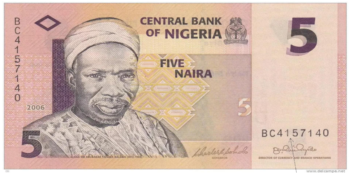
Figure 1.2: Five Naira Note (Nigerian Paper Currency)