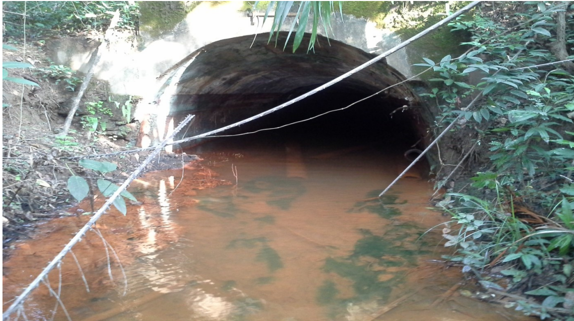
Fig 2: Point source of Oro-obo River at Okpara mine