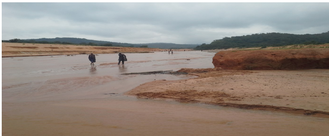
Fig 4: The meeting point of Oro-obo and Nyama River