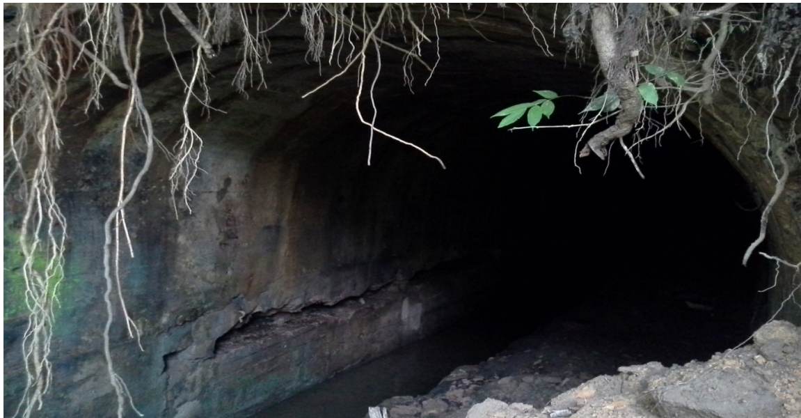
Fig 3: Onigbo mine at Okpara mine; another point source of Oro-obo river.