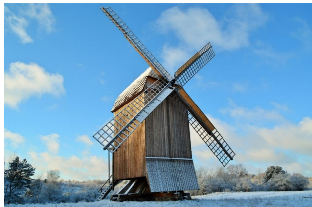
Fig. 8 Koźlak windmill in Olsztynek (Igliński et al. 2020b)

Taking into account all the limiting criteria for the buffer of 2150 m, the area of the area available is 245 km 2 , i.e. 1.0% of the territory of Warmińsko-Mazurskie Voivodeship (Fig. 9).