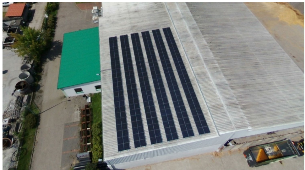
Fig. 11 Photo of the PV installation on the roof of Pisz heating plant (Igliński et al. 2020b)

The strong points of PV include the fact that the installation of PV panels together with an energy storage facility provides electricity in places where access to the power grid is difficult, e.g. on the islands in Warmińsko-Mazurskie Voivodeship (Igliński et al. 2020b).