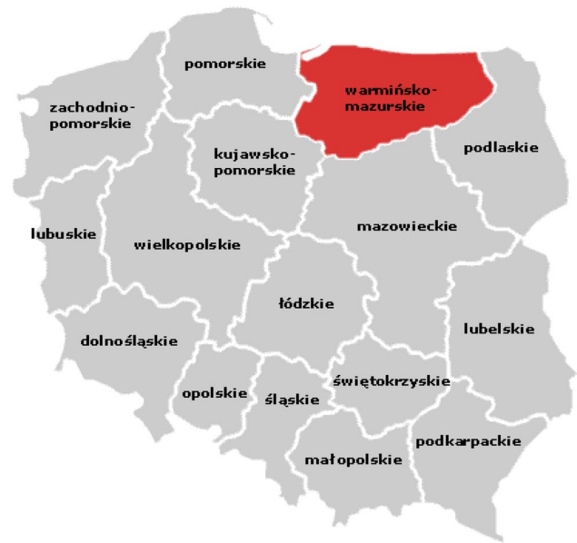
Fig. 1 Location of Warmińsko-Mazurskie Voivodeship

As it has been mentioned above, electricity flows to the Warmińsko-Mazurskie Voivodeship from the distant power stations placed hundreds of kilometers away. Storms or wet snow very often tear off powering cables, as a result of which electricity is no longer supplied to certain regions. The solution to the problems indicated above is the faster development of own energy based on local energy sources, i.e. RE. RE involves small generation units located close to the recipient, which allows to increase the