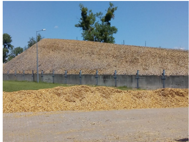
Fig. 3 Waste chips stored on the Pisz heating plant site

chips are delivered to the Pisz heating plant by the numerous sawmills in the region (Fig. 3), while waste biomass (mainly branch biomass) is delivered to the Pisz heating plant by municipal services (tree pruning), as well as by local residents (Igliński et al. 2020b).