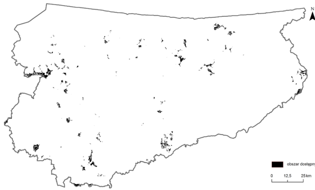
Fig. 9 Area available for aeroenergy development for buffer 2150 m (own study)

Methodology for calculating the technical potential of wind energy in the Warmińsko-Mazurskie Voivodeship.