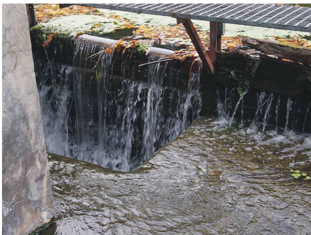
Fig. 6 SHP "Niewodnik II" (Igliński et al. 2020b)

For example, the “Niewodnik I” power plant (Fig. 5) has been operating since 1989 on the ruins of the former water mill from the mid-sixteenth century, the current hydrotechnical system was shaped at the beginning of the twentieth century, two propeller turbines with a diameter of 395 and 700 mm were installed in the power plant, water falls from a height of 2.40 m. The “Niewodnik