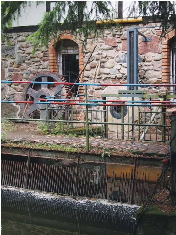
Fig. 5 SHP "Niewodnik I" (Igliński et al. 2020b)