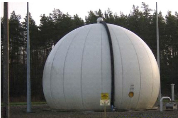
Fig. 2 Installation for the energy use of biogas from a sewage treatment plant in Nowa Wieś Elcka (Igliński et al. 2020b)

It is worth mentioning that the largest district heating plant in Poland with a capacity of 21 MW operates in Pisz (south-eastern part of the Voivodeship). The facility is equipped with 3 boilers type VRF 6000 with nominal output of 6 MW each and one boiler type VRF 3000 with output of 3 MW. The boilers are manufactured by a Swiss company named Polytechnik. The boilers are designed to burn biomass in the form of wood chips and bark. Waste