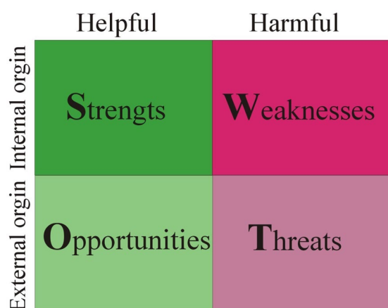
Fig. 4 SWOT analysis diagram (own study)

SWOT analysis allows you to systematise knowledge, to see new opportunities or threats, to be sensitive to certain issues. It is a good method to identify the market or environment, verify design assumptions, research trends, etc. (Chen et al. 2014).