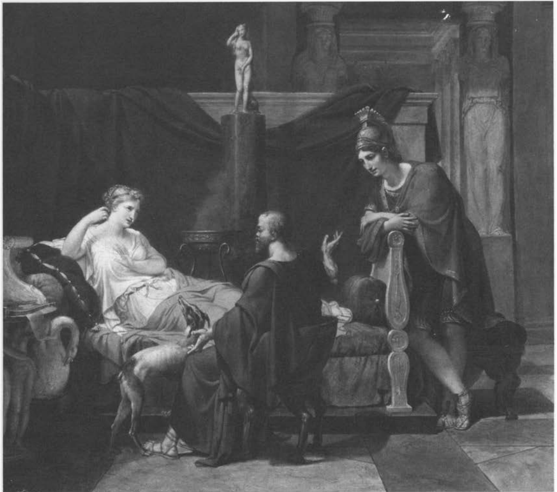
2. Socrates and Alcibiades in the Home of Aspasia. Oil painting by Antoine-Jean-Joseph-Eleonore-Antoine Ansiaux. Current location unknown.