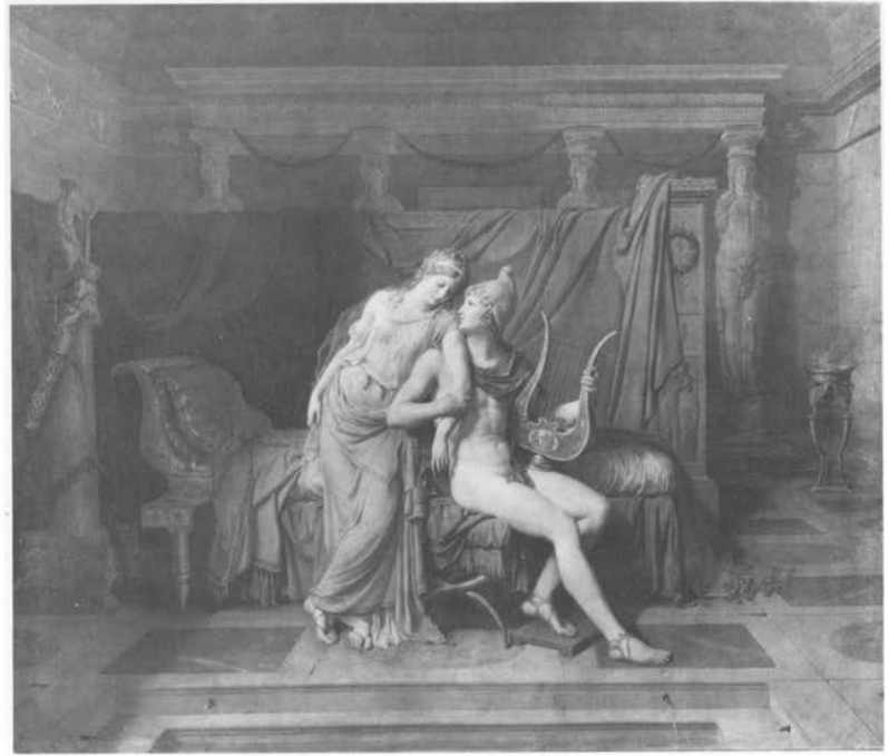
9. Paris and Helen . Oil painting by Jacques-Louis David. Musée du Louvre, Paris.

Ansiaux's allegory is notable for specifically including the arts and commerce as the direct result of good government. His two antique history paintings suggest the same idea in narrative rather than allegorical form. Alexander, the virtuous ruler/patron, and Socrates, the philosopher of Periclean Athens, exemplify the triumph of art and philosophy in times of peace and wise government. Their essentially conservative, idealized neoclassic style and decorous treatment underscore the message of harmony and traditional values which should have appealed to the citizen-monarch of the French people, Louis-Philippe, or at least would have been appreciated by some less well-born citizen-art collectors.