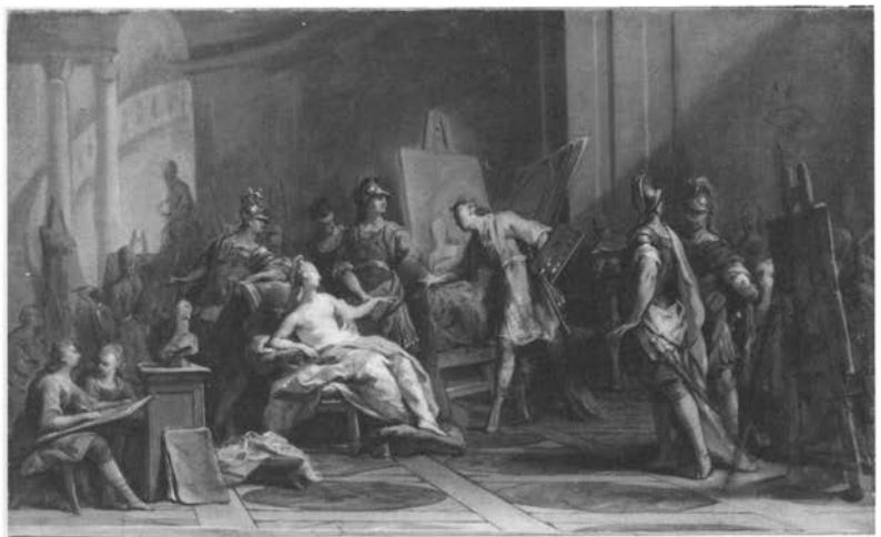
3. Sketch for Apelles in His Studio with Alexander. Oil painting by Jean Restout.