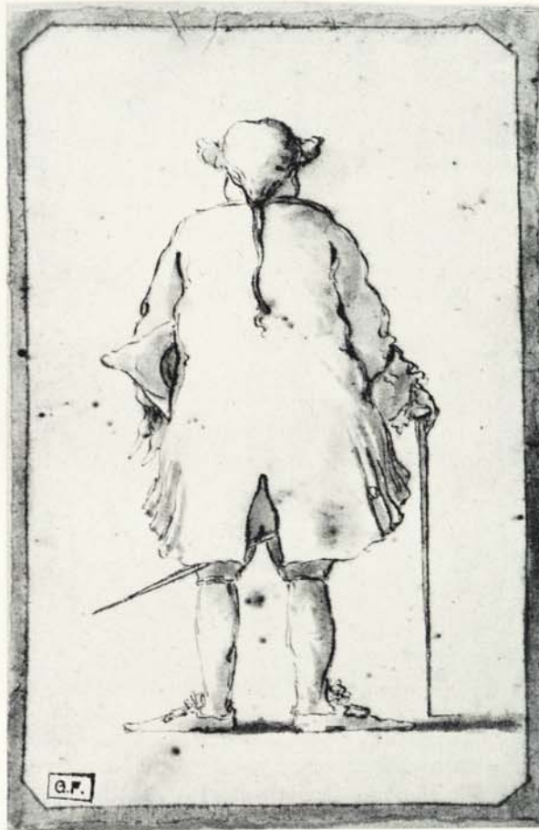
1. A Gentleman. Pen and ink drawing by Domenico Tiepolo. Museum of Art and Archaeology, University of Missouri-Columbia.

originally belonged to the Tomo terzo . Moreover, some of them, such as the Gentleman now in the Museum of Art and Archaeology, University of Missouri-Columbia (Fig. 1), 8 seem to have been created after 1762.