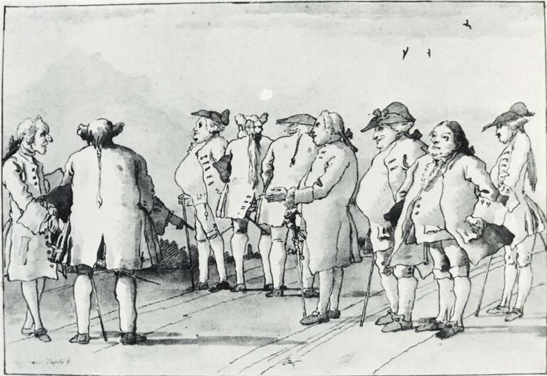
6. A Group of Gentlemen. Pen and ink drawing by Domenico Tiepolo.

difficult task. The similarity in type and treatment of the Missouri drawing to the above-mentioned works may indicate a like relative date. The Country Walk (Fig. 5) and the Cardplayers , as well as the Gentleman in the Metropolitan Museum (Fig. 3) each bear a signature, and, as Byam Shaw proposes, such signatures almost always occur on drawings of the second half of Domenico's career. 14 On the basis of this circumstantial evidence, a date after 1790 can be considered most likely.