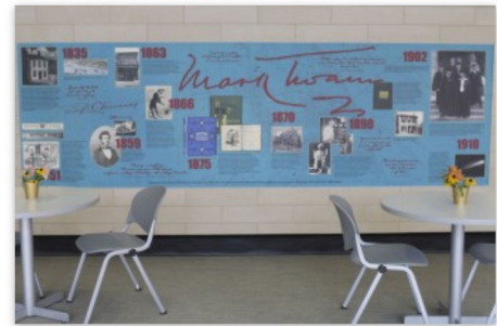
A mural on the first floor of the hall shows a timeline of Mark Twain's life.

In keeping with Mizzou's commitment to sustainability, finish materials and furnishing containing recycled content were used wherever possible, building materials were purchased within a 500-mile radius if possible, and there are recycling receptacles on each floor.