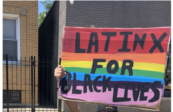
A person holds a rainbow colored sign reading "Latinx for Black lives" during a May 6 walk organized by Activate:Chi, a grassroots organization based in Chicago.