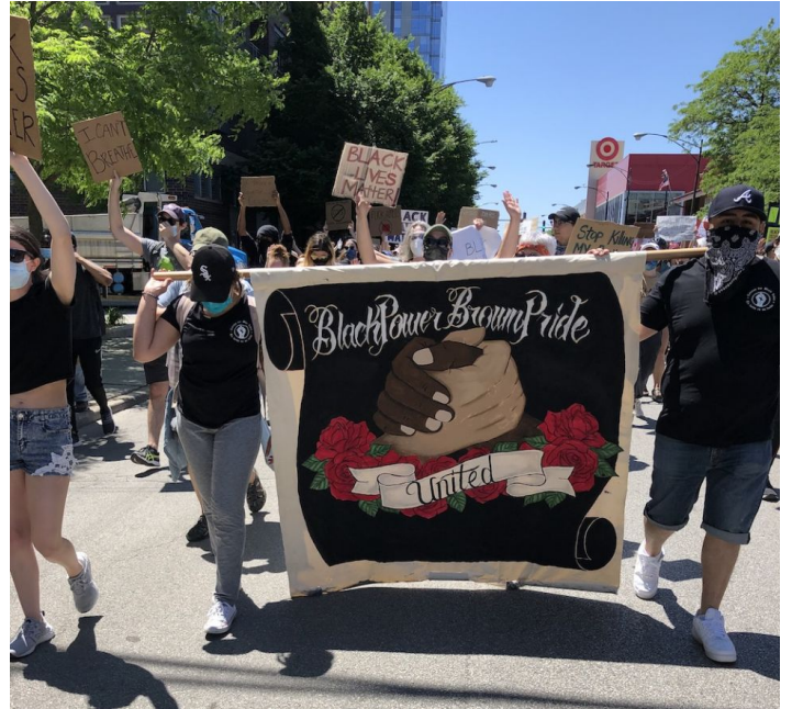
Over 30,000 protestors participate in a May 6 walk organized by Activate:Chi, a grassroots organization group based in Chicago.