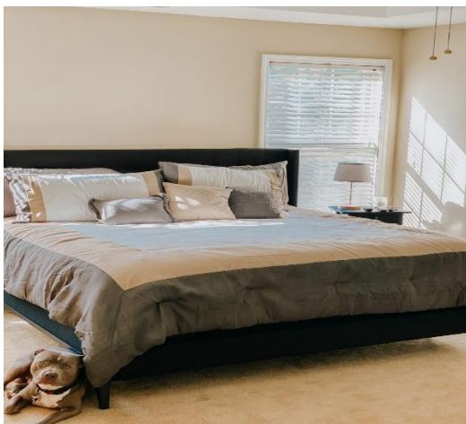
Tammy’s Photovoice Submission