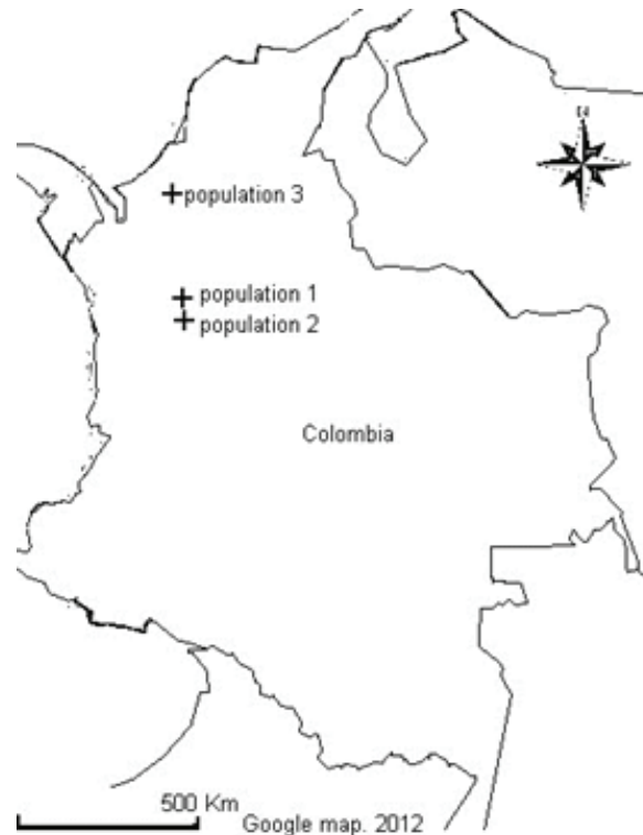
Figure 1. Location of three populations of red pitahaya ( Hylocereus spp.) collected in different regions of Colombia.

third population is located in the municipality of Monteria (Córdoba Department) (08°72'08,1"N 75°59'55,98"W), whose average temperature is 27.9 °C and annual average rainfall is 1,285 mm (The National Weather Service, 2012). All locations correspond to a tropical dry forest zone (Figure 1).