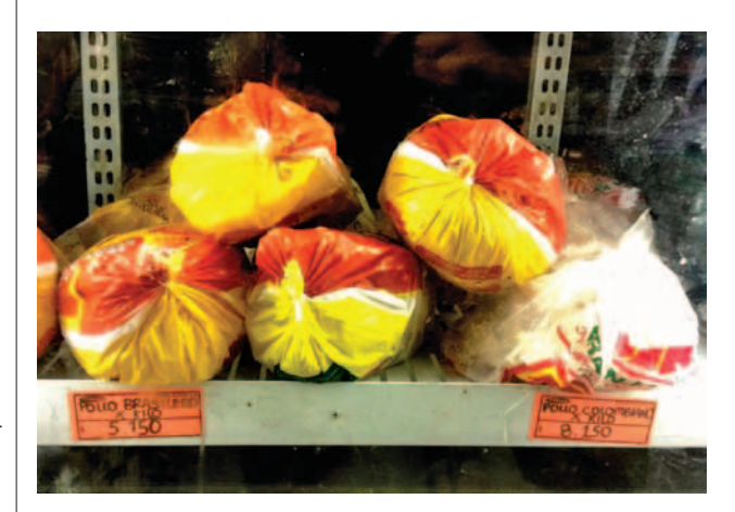
Figure 6. Brazilian frozen chicken and Colombian side by side in Leticia supermarket.

Colombian supermarkets visited, especially in the city of Leticia, sell the Brazilian industrialized-frozen chicken, alongside the sale of Colombian chicken (figure 6), but with a clear distinction between products. The Brazilian industrialized-frozen chicken, despite being cheaper, is taxed as an unhealthy product, containing hormones that affect health, contrary to Colombian chicken, which is sold by traders as a free range product free of hormones and medications, but with a higher price, which in fact leads to strong demand for Brazilian chicken.