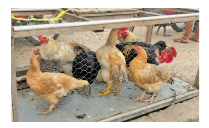
Figure 5. Commercialization of hens and cocks in the external part of the Municipal Market of Tabatinga. Source: Avelino da Costa, May 2014.

In the cities studied, there are few chicken farmers that produce and commercialize in an organized format. Producers visited work with regional chicken production parallel to the laying hens, and initially the creation of free-range chickens is focused on the family's own supply, then the production surplus is sold to neighbors or relatives. Many have found this activity an opportunity to achieve economic success, so investing resources in adapting their backyards into areas aimed at creating free-range chickens such as fencing and building chicken coops in an amateur way is usually the procedure. The commercialization can happen at the producer homefarm or in more established places such as the local market and fairs (figure 5).