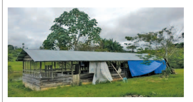
Figure 3. Shed for raising farm chicken in Benjamin Constant.

According to local producers, for every hundred chicks at least twelve food sacks of various types are consumed on average, in a process that lasts forty-five days; at the end of that period the bird is ready to be harvested and sold to the consumer. According to information obtained from producers if there is no demand for the birds, these are fed with wheat bran (farelo de trigo) until there is a demand and the slaughtering is performed. Wheat bran according to the producers ensures that the bird food will result in a flavor similar to the purely free-range chicken (figure 3).