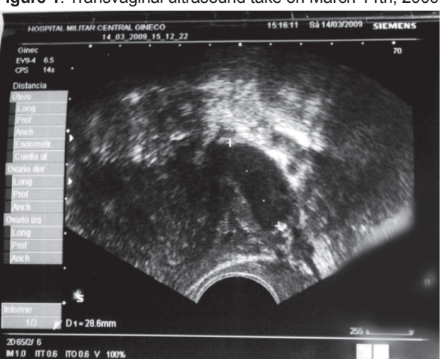
Figure 1. Transvaginal ultrasound take on March 14th, 2009

was painful upon palpitation; left adnexa and pouch were palpable and painful. No other findings were observed during the physical examination. A transvaginal ultrasound revealed 35x34x23 mm left ovary with a 20x20 mm cystic image inside it; an elongated-mass was observed with particulate liquid inside it, resulting in a diagnostic finding of left adnexal and left hydrosalpinx masses (Figure 1).