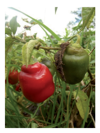
Figure 1. The intense red color in rocoto pepper fruits. Evidence of physiological maturation stage.

To guaranteed seed extraction, longitudinal cuts were made on fruits using surgical masks and latex gloves (Pacheco & Zuñiga, 2007). Seed disinfection was performed by seed washing with hypochlorite water solution at concentration of 5% v/v, followed by two washes with deionized water. Subsequently, seeds were dried at room temperature for one day.