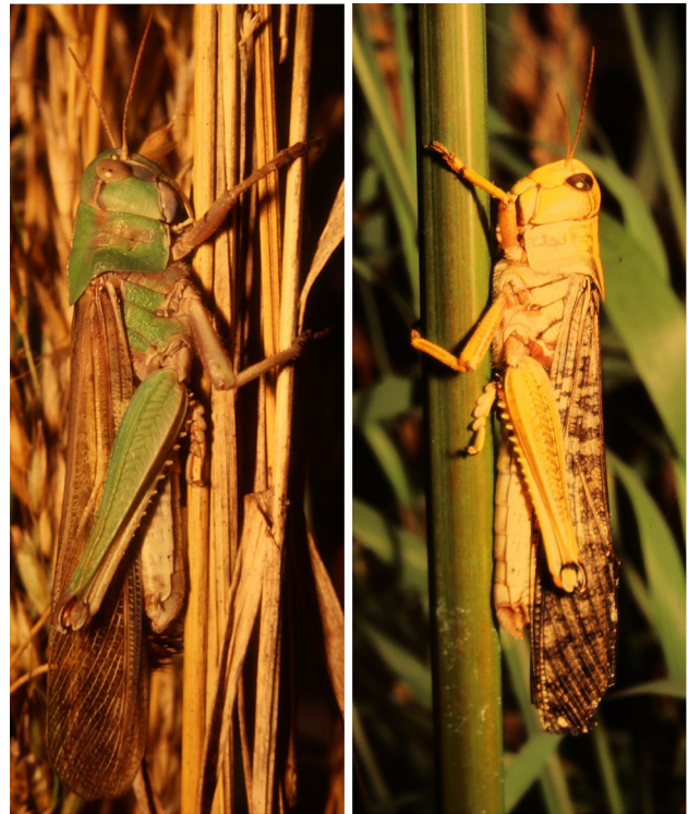
Fig. 2 Two males of Locusta migratoria from a breeding experiment in the lab of Peter Bräunig. The one on the left is in the solitary, the one on the right in the gregarious phase. Please note differences in colour, shape of pronotum, and length of hind leg femur.

preferences of breeding places. However, male genitalia, a morphological feature employed for exact species determination in insects, were of very similar shape, and artificial breeding experiments yielded nymphs with features of L. danica that had hatched from L. migratoria egg pods (Uvarov 1921). Nowadays it is clear that approx. 20 species of grasshoppers world-wide, taxonomically not closely related in most cases, may have the potency to form swarms and exhibit different phases (a phenomenon now called polyphenism, meaning the same genotype exhibiting several phenotypes; Simpson and Sword 2008; Pener and Simpson 2009). The species studied most are the migratory locust, Locusta migratoria , and the desert locust, Schistocerca gregaria . Detailed studies in both species, revealed that all kinds of intermediates between the phases can be found and that transitions between phases can occur at any stage and in both directions, all depending on the density of populations (Pener 1991; Pener and Simpson 2009). Each of the 20 species must be regarded separately with respect to phase changes as clear species-specific differences and even geographical variants within one species may exist (Pener and Simpson 2009). For example, solitary individuals of Schistocerca gregaria possess six larval instars (stages as nymphs) whereas gregarious ones only have five larval instars.